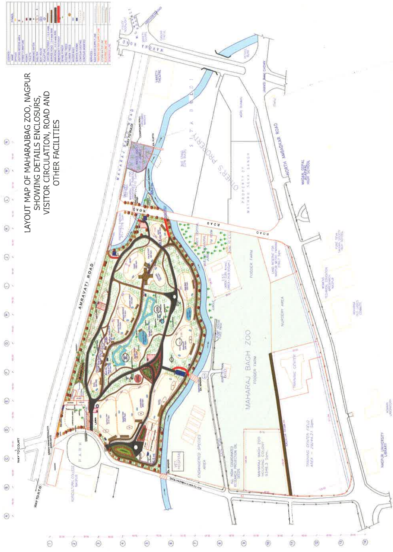
LAYOUT MAP OF MAHARAJBAG ZOO, NAGPUR SHOWING DETAILS ENCLOSURES, VISITOR CIRCULATION, ROAD AND OTHER FACILITIES