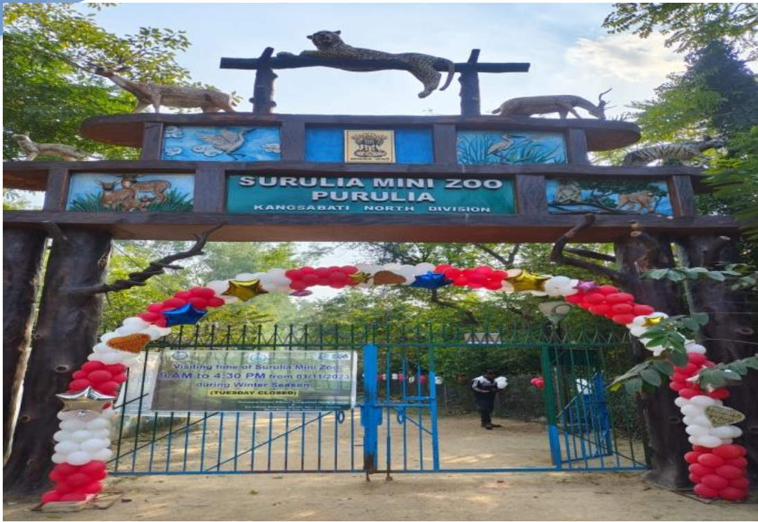
Christmas Celebration- 2024