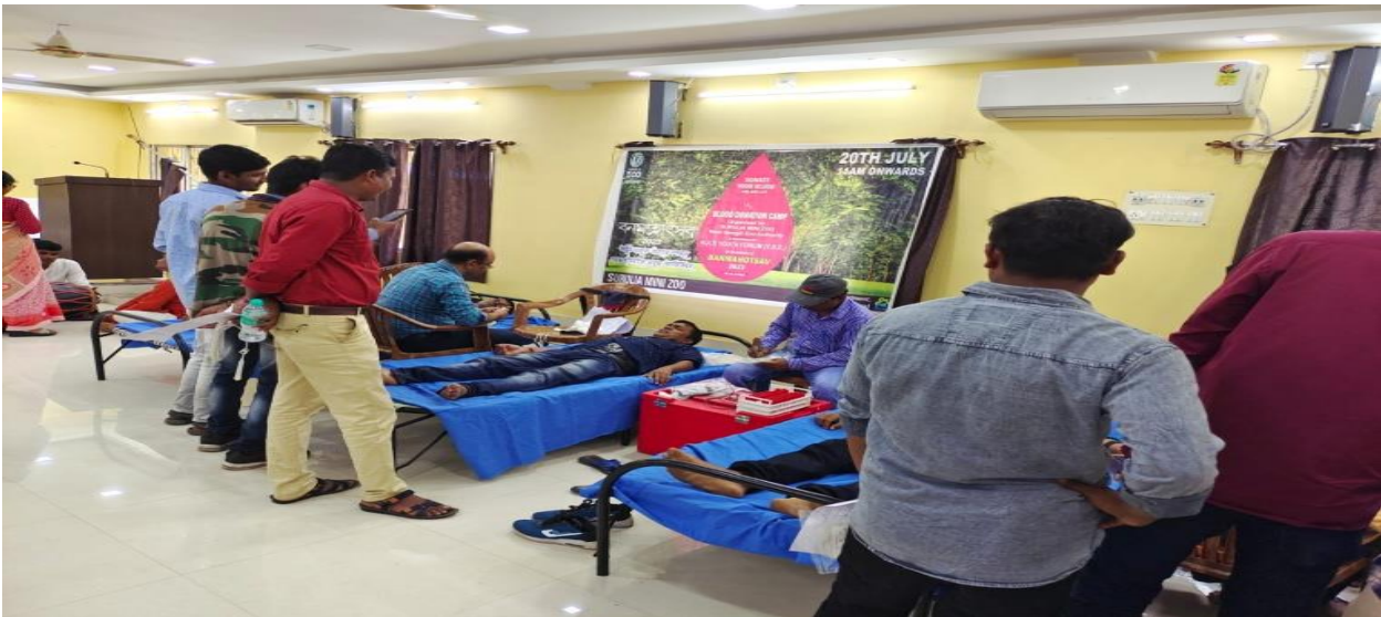
Blood Donation camp at zoo premises