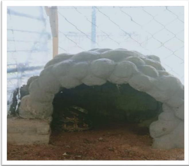
Fishing Cat and Python within their enclosure