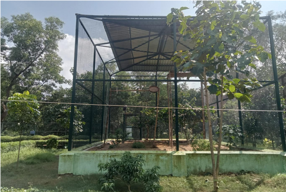
Construction of Aviary Enclosure