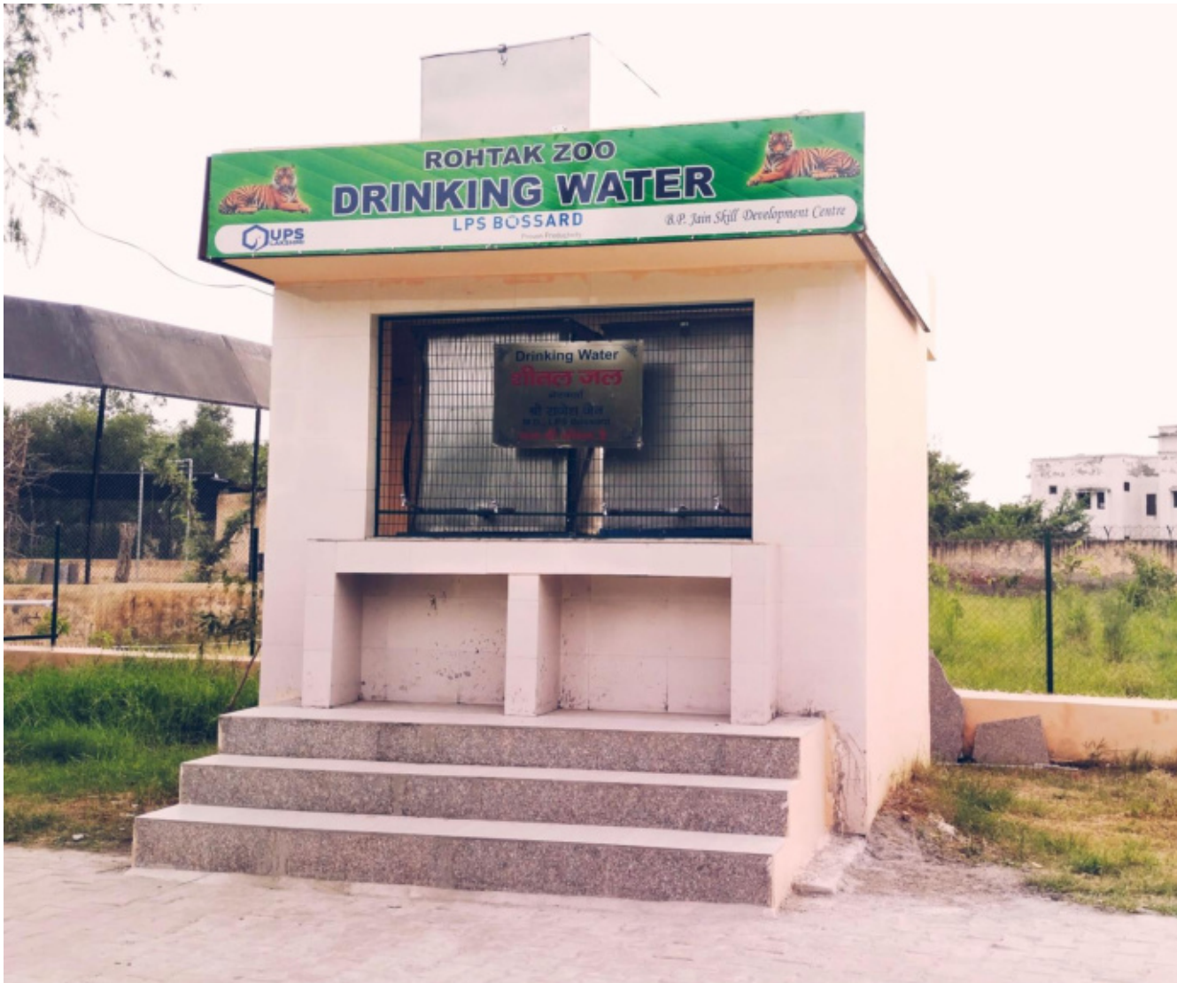
Drinking Water Point at Rohtak Zoo