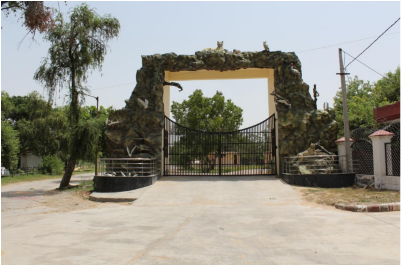
Main Gate of the Rohtak Zoo

2. History of the Zoo – Rohtak Zoo was established in the year 1986 on an area of 7.20 hectares (10 acres) of Tilyar Tourist Complex Rohtak. It is located on the right side on Delhi Rohtak road about 70 Km from New Delhi in Rohtak city. Later on 44 acres of land was transferred from Tourism Department Haryana for the renovation of Rohtak Zoo. The renovation works are still going on and these will take another one or two years to be completed