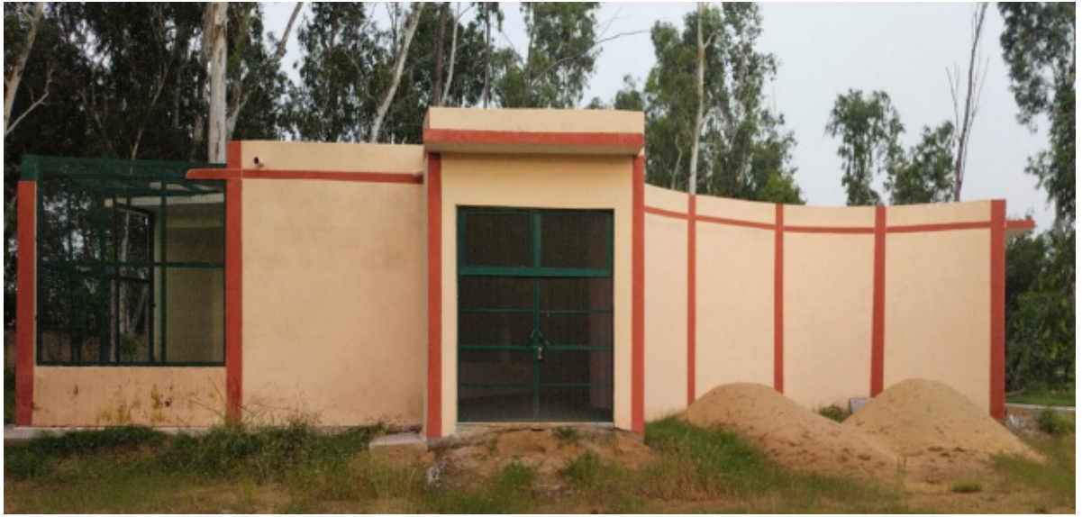
Nocturnal House at Rohtak Zoo