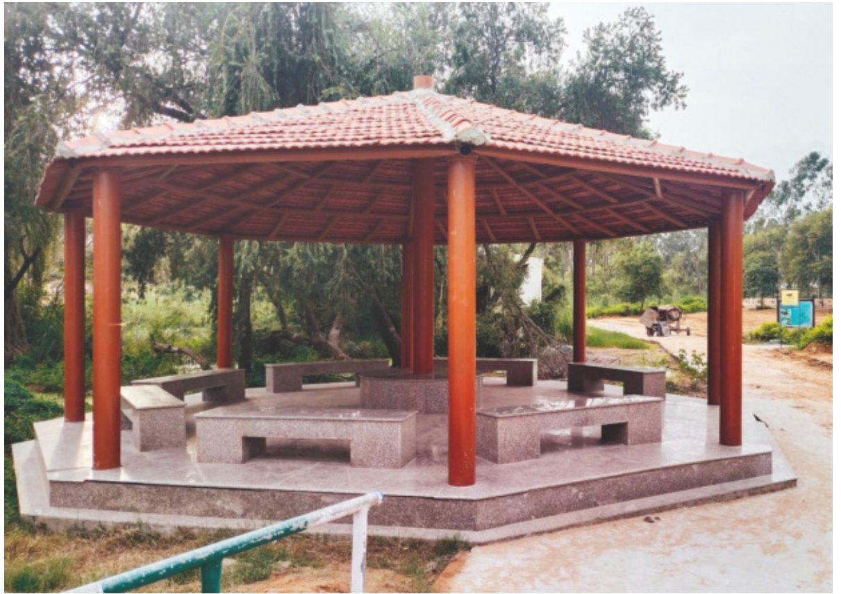
Visitor's Shed /Gazebo at Rohtak Zoo