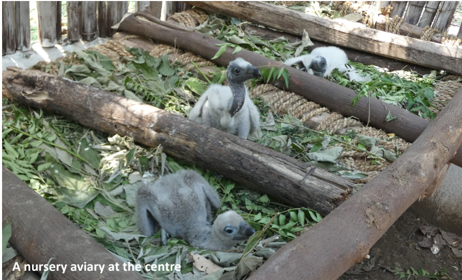
A nursery aviary at the centre

Successful breeding at VCBC Pinjore was noted in 2008 and intensive breeding by artificial incubation was taken up in 2010, double clutching in 2011 and chick swapping in 2014 as a result of which VCBC Pinjore hatched and fledged 300 plus vulture nestlings between 2010 to 2023.