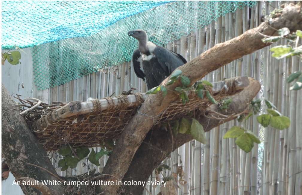
An adult White-rumped vulture in colony aviary