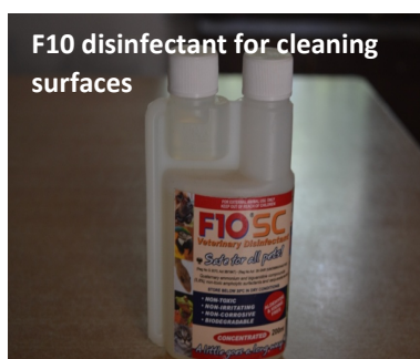
F10 disinfectant for cleaning surfaces