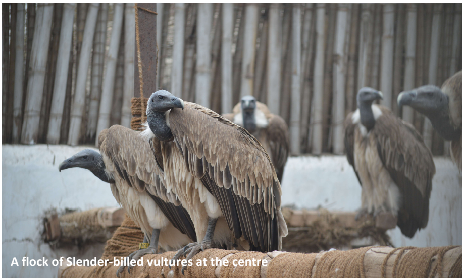
A flock of Slender-billed vultures at the centre

To establish a founder population of 25 pairs of each of the three endangered vulture species viz. White-backed vulture, Long-billed vulture and Slender-billed vulture.