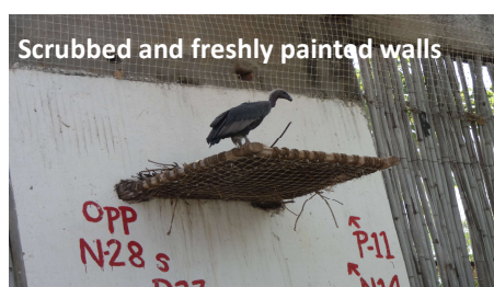
Scrubbed and freshly painted walls