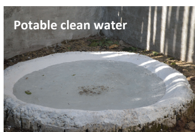
Potable clean water