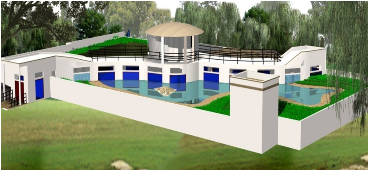
3D VIEW (THEMATIC PRESENTATION) OF CHELONIA SECTION