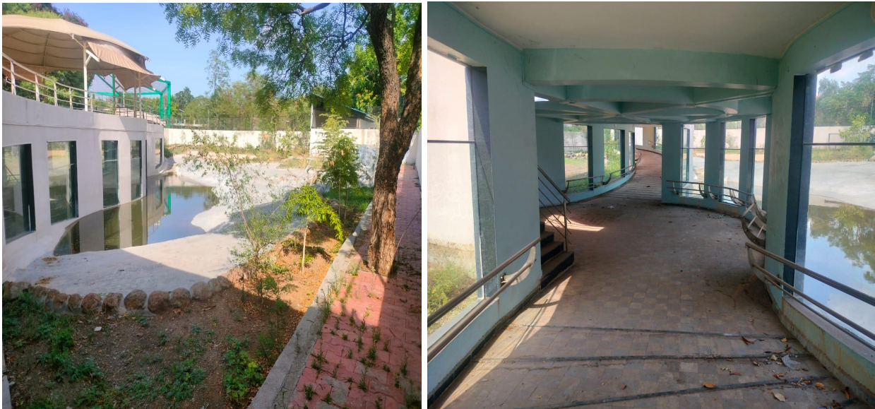
Current status of chelonia enclosures