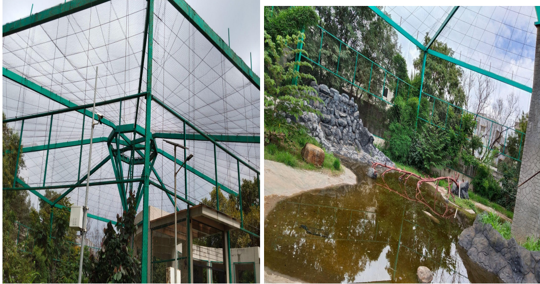
Current status of wetland aviary