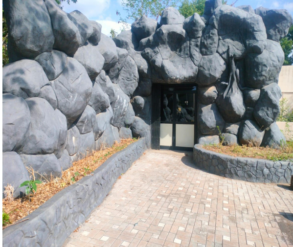
Current entrance of reptiles of ghat