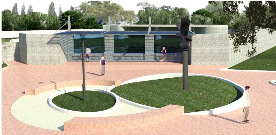
3D VIEW OF MUGGER AND GHARIAL ENCLOSURE (THEMATIC REPRESENTATION)