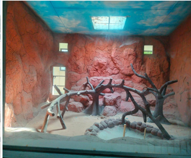
current status of snake enclosures