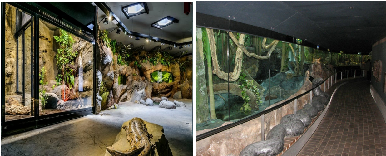
3D view of thematic representation of reptiles of ghat