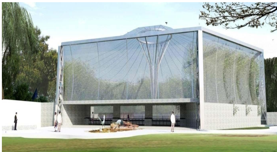
3D VIEW OF WETLAND AVIARY (THEMATIC REPRESENTATION)