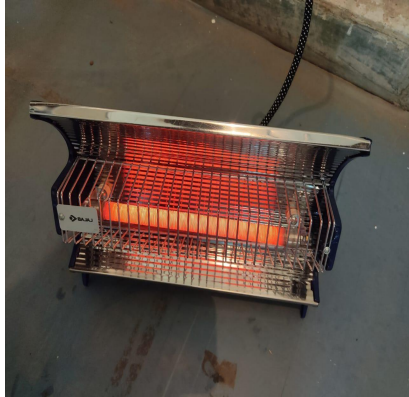
Room heaters to control temperature

7. Monitoring and Regular Maintenance: Enclosures should be regularly monitored for any signs of wear and tear that could compromise the animal's safety. Regular maintenance of heating and cooling systems, water sources, and enclosures are necessary.