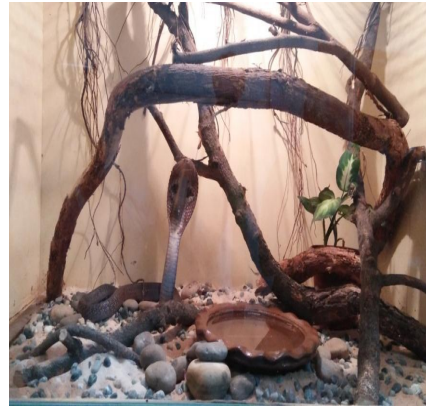
Snake boxes with incandescent light bulb