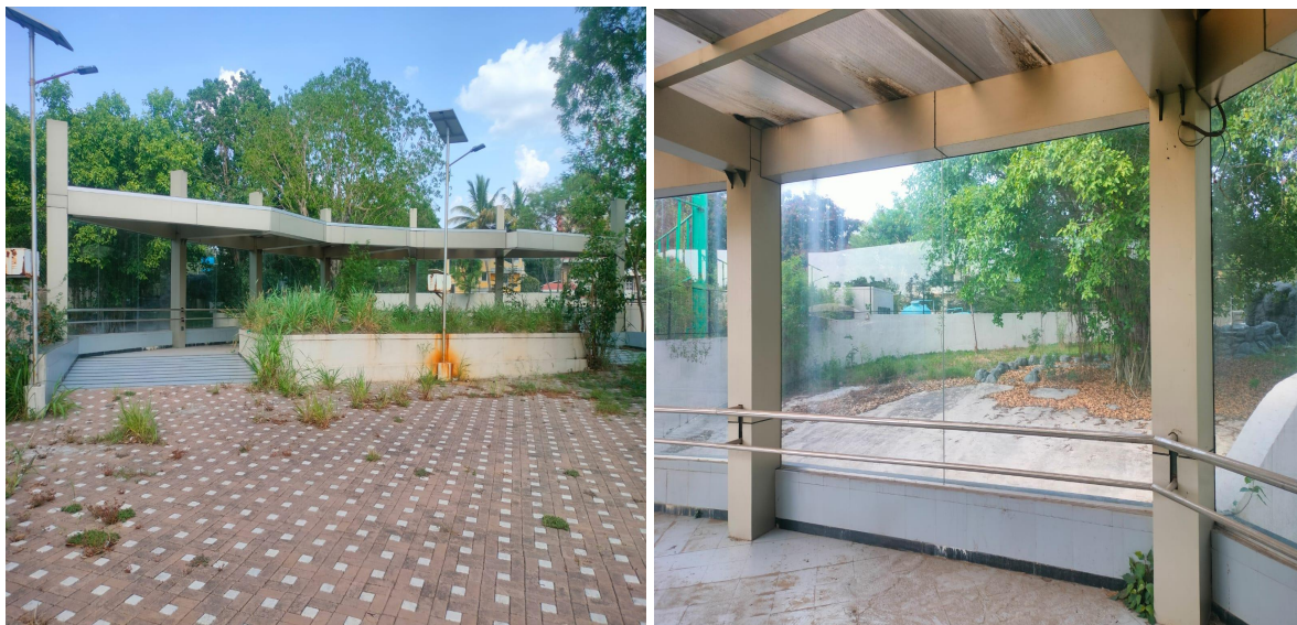
Current status of work in muggar and gharial section