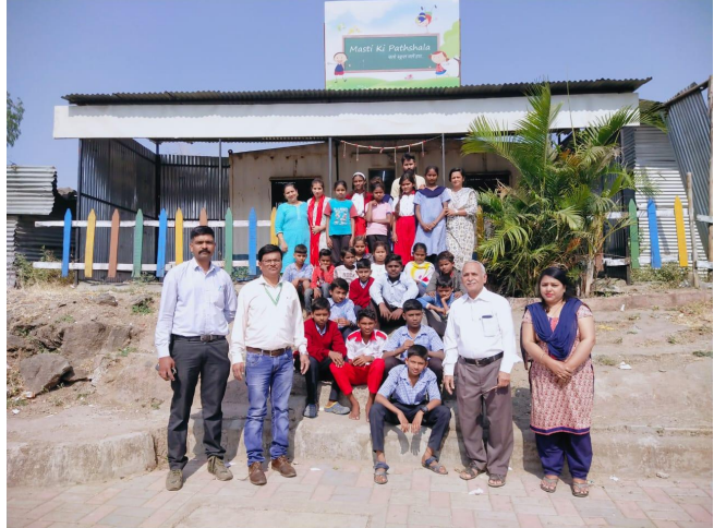
Additional Commissioner, PCMC