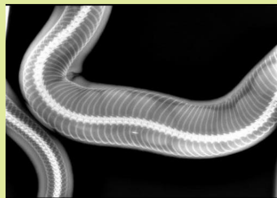
X-ray of a green anaconda (Follicles and identification PIT seen)