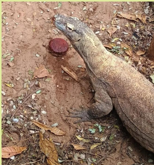
Blood popsicles for the Komodo dragons in summer