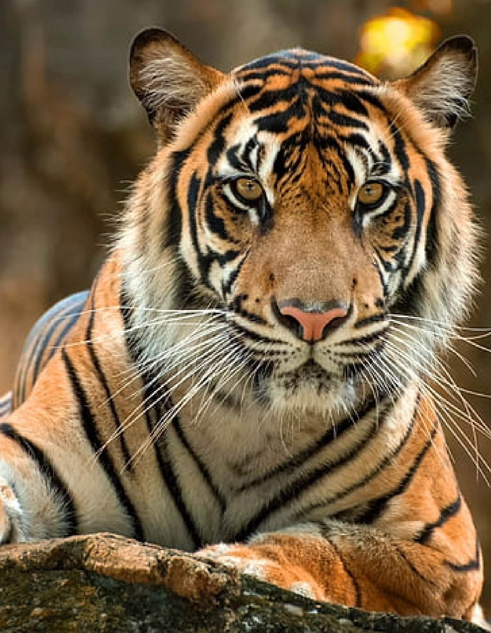
नवाब वाजिद अली शाह प्राणि उद्यान, लखनऊ, उत्तर प्रदेश