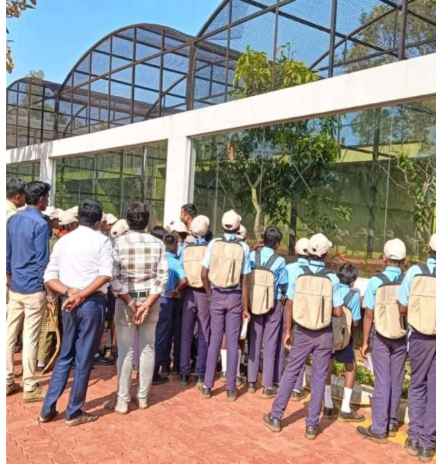
School Name: Government High School, Mamadapur Tq: Vijayapur Range : Vijayapur