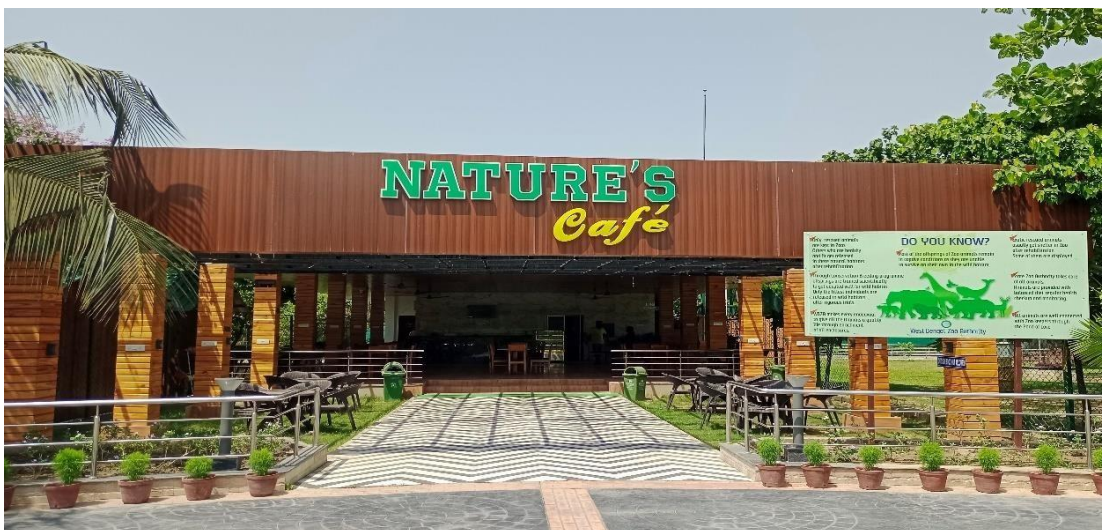
Repairing and Renovation of existing cafeteria