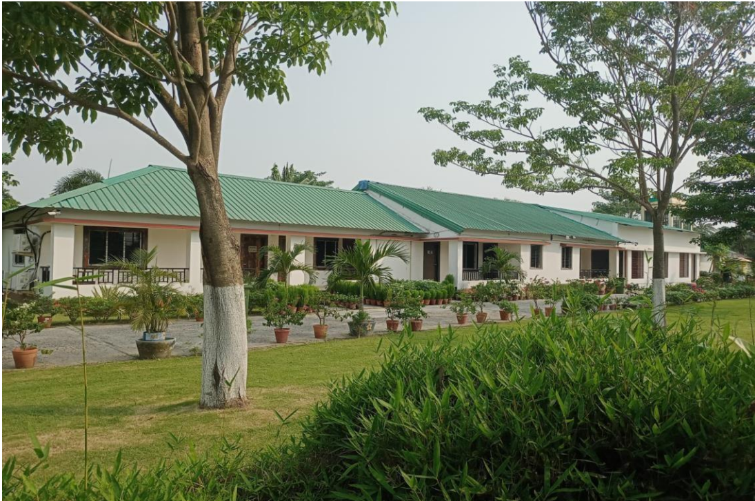
Renovation of Administrative Zone