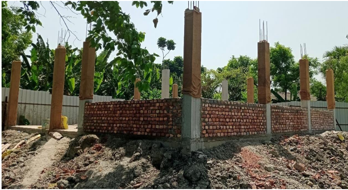
Renovation Works for Vermicomposting shed