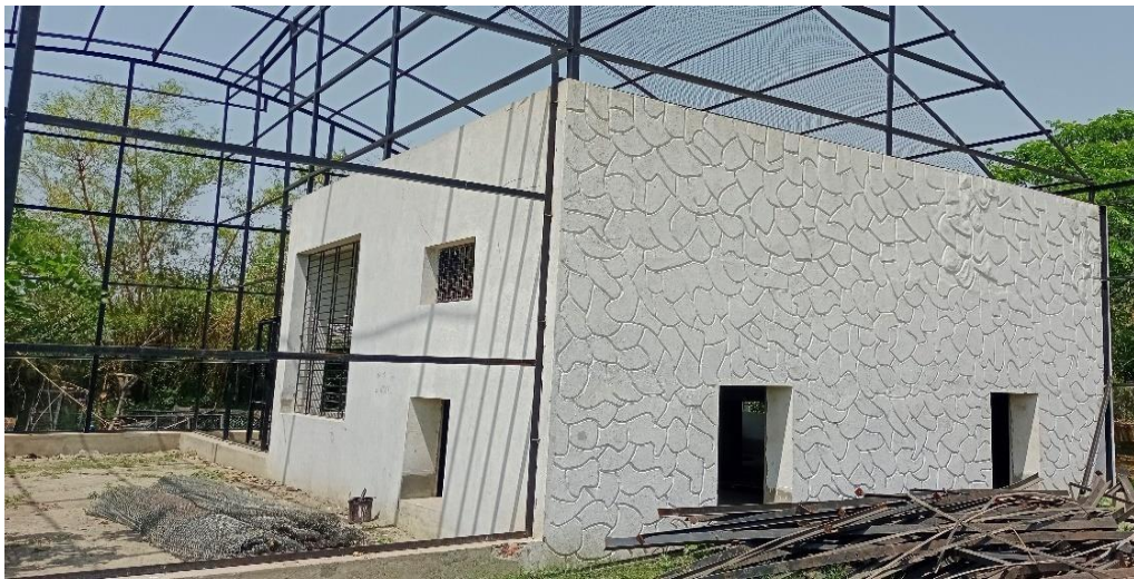
Additional Work for Red Tailed Monkey Enclosure