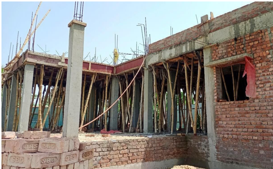
Construction of Store