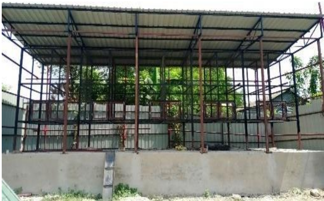
Construction of Quarantine cage in Rescue centre