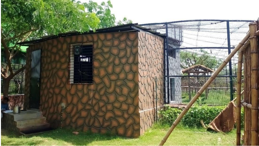
Additional works for Hoolock Gibbon Enclosure and Night Shelter