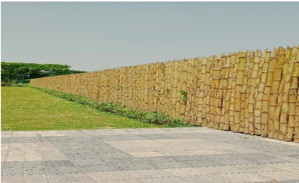
Decorative Bamboo fencing at Harinalaya