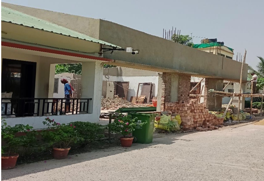
Extension of Seminar Hall