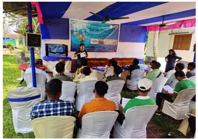
Workshop arranged on World Turtle Day