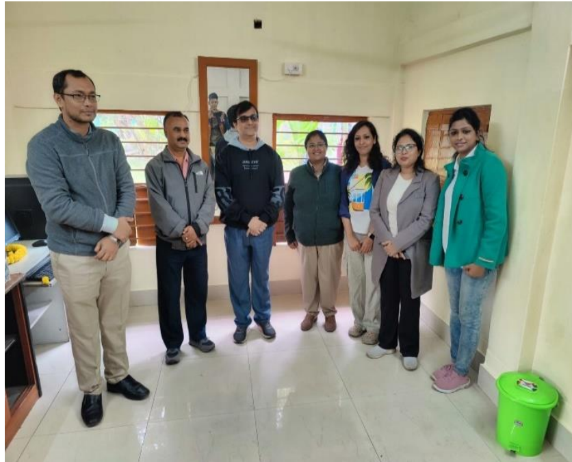
Inauguration of DFO Camp Office at Garchumuk Zoological Park