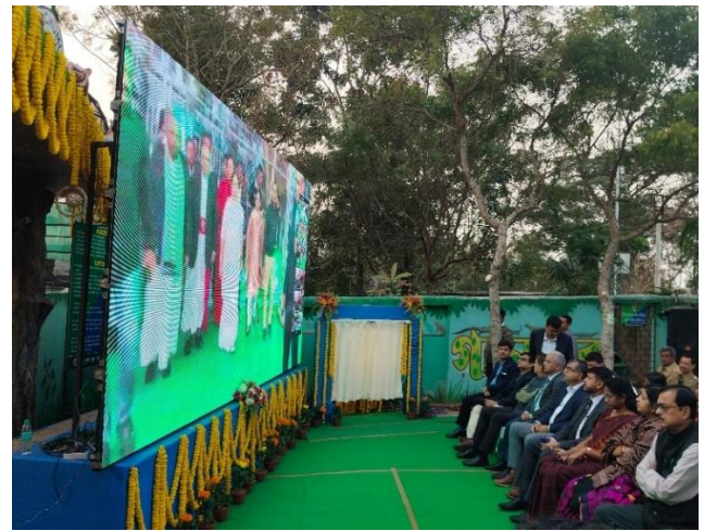
Inauguration of Garchumuk Zoological Park as a 'Mini Zoo'