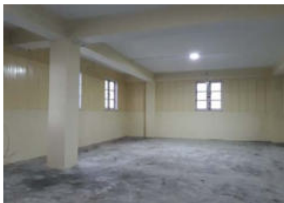
Construction of New Taxidermy Unit at Bengal Natural History Museum