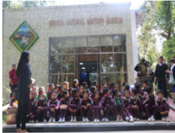
Notre Dame School, Kainjalay Bazar