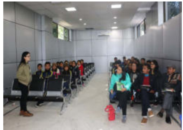
Rabindranath Higher Secondary School