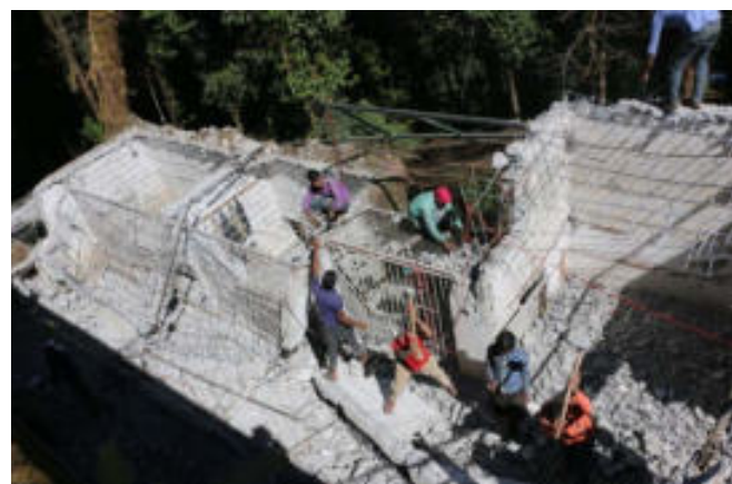
Construction of new Veterinary Hospital at PNHZ Park