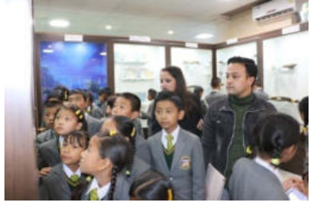
Bal Narayan Memorial School