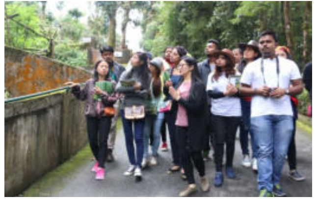
N.E.R.I.S.T, Itanagar, Arunachal Pradesh