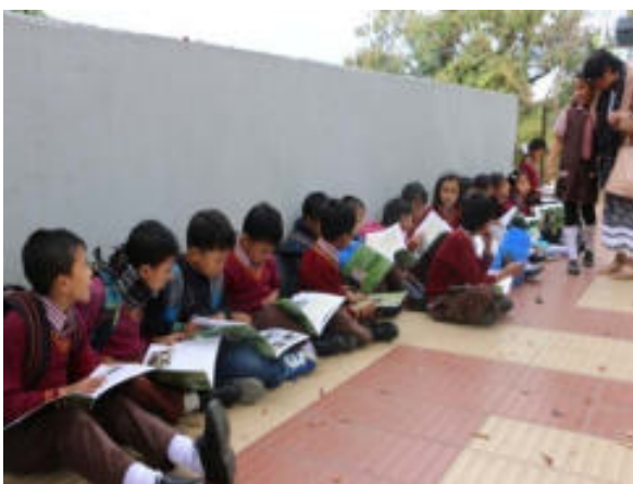
Ferrando Preparatory School