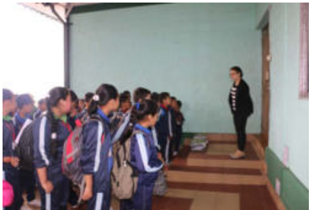
Greenhill English School