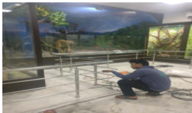
Installation of barriers at Bengal Natural History Museum