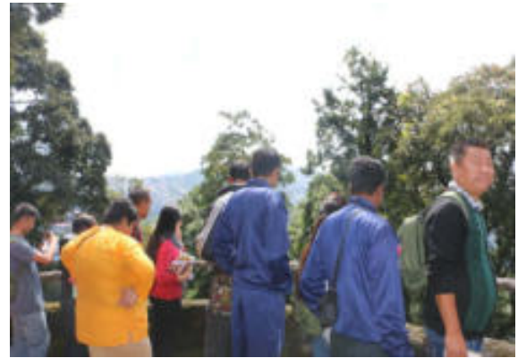
106 th Batch of Deputy Rangers, State Forest training Institute, Hijli