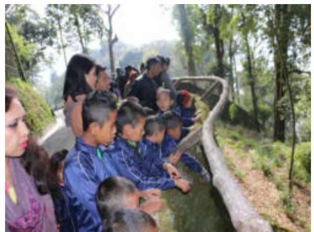
Shahid Krishna School