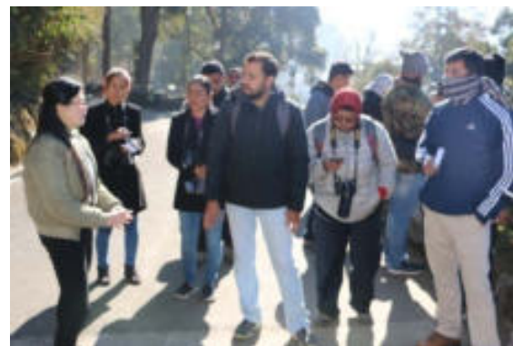
Wildlife Management tour of officer trainees of XXXIICC, (Assam) Wildlife Institute of India. Dehradun.