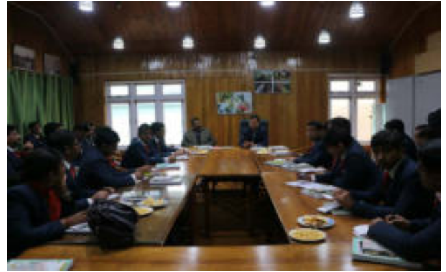
East Indian Tour of Officer Trainees of 15-17 SFS Batch, Dehradun