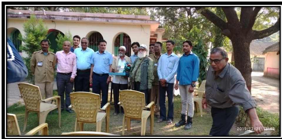
Food quality checkup by Zoo Advisory Committee.