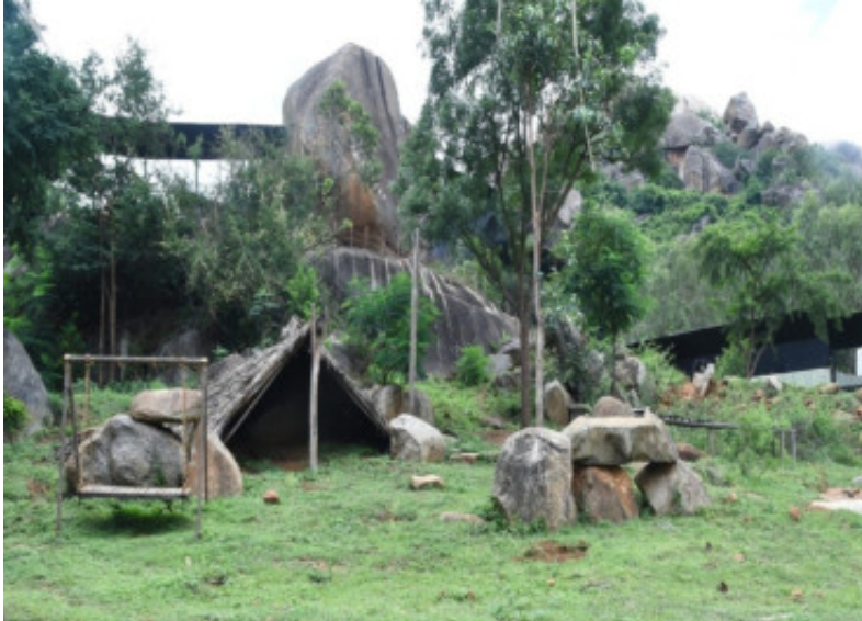
SLOTH BEAR ENCLOSURE