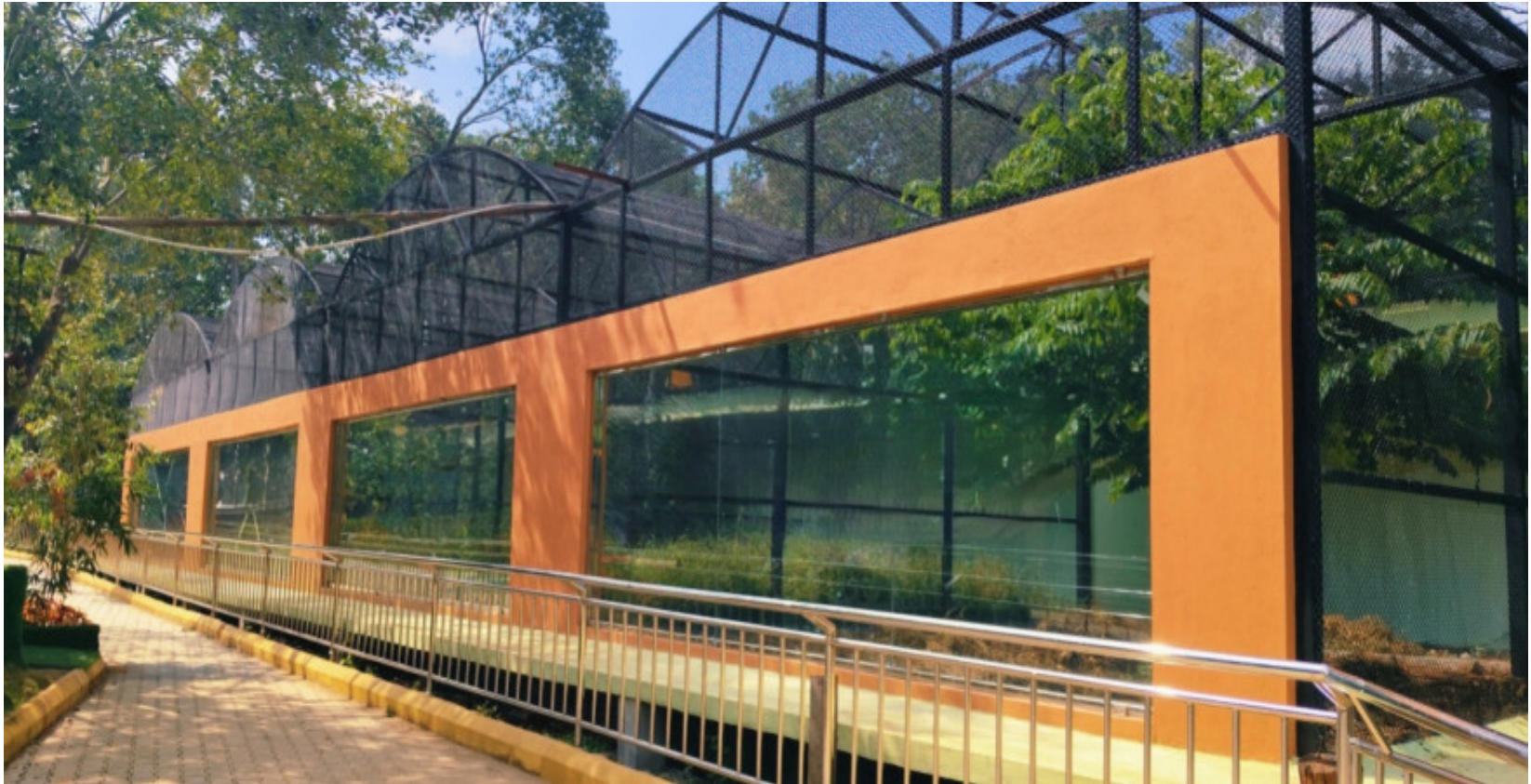
Exotic Birds Enclosure