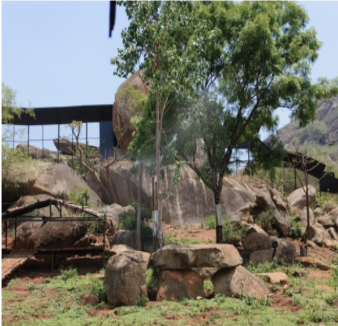
SLOTH BEAR ENCLOSURE