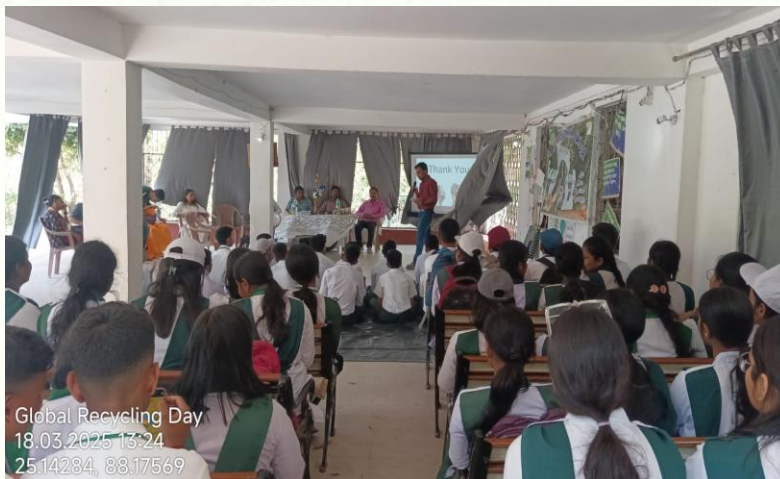
Fig: Photos are captured during awareness programmes at Adina Deer Park