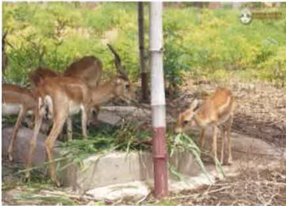
Black Buck at our Wildlife Rescue Centre