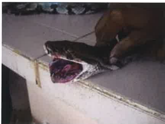
Beaten up by the shepherds. Rescued and kept in our shelter till it recovers and released