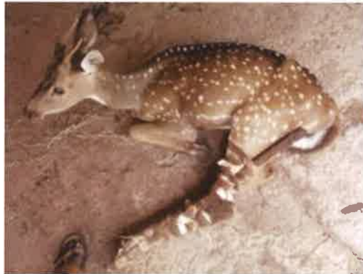
2012 on arrival

More than one year ago a young spotted deer was brought in by the forest department. Her leg was deeply infected, inflamed and paralyzed. The chances of recovery at this stage were minimal.