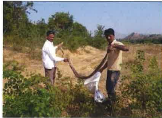
Snake rescued from a farm, it was dehydrated, can not survive