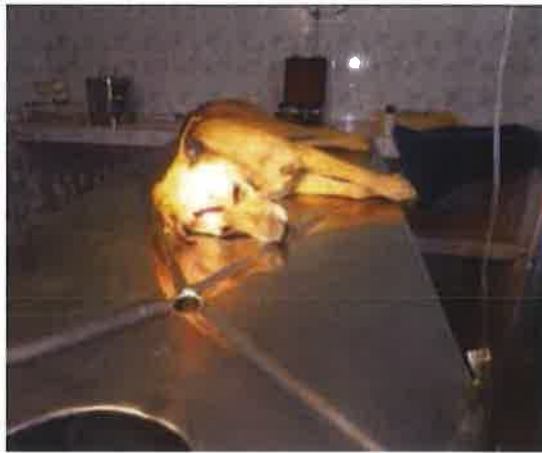
A dog is brought in after being bitten by a wild pig and has surgery