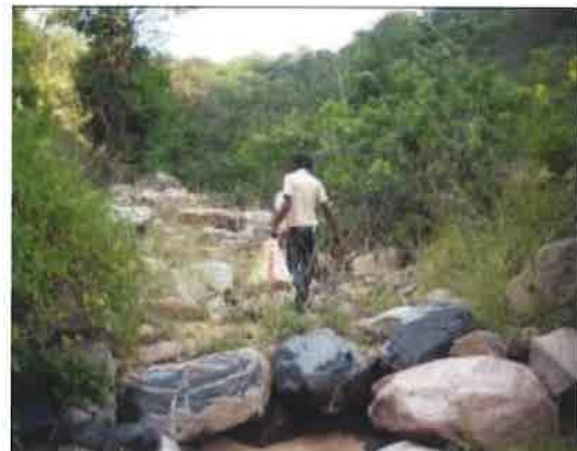
Rescue and release of another snake near a school in Puttaparthi