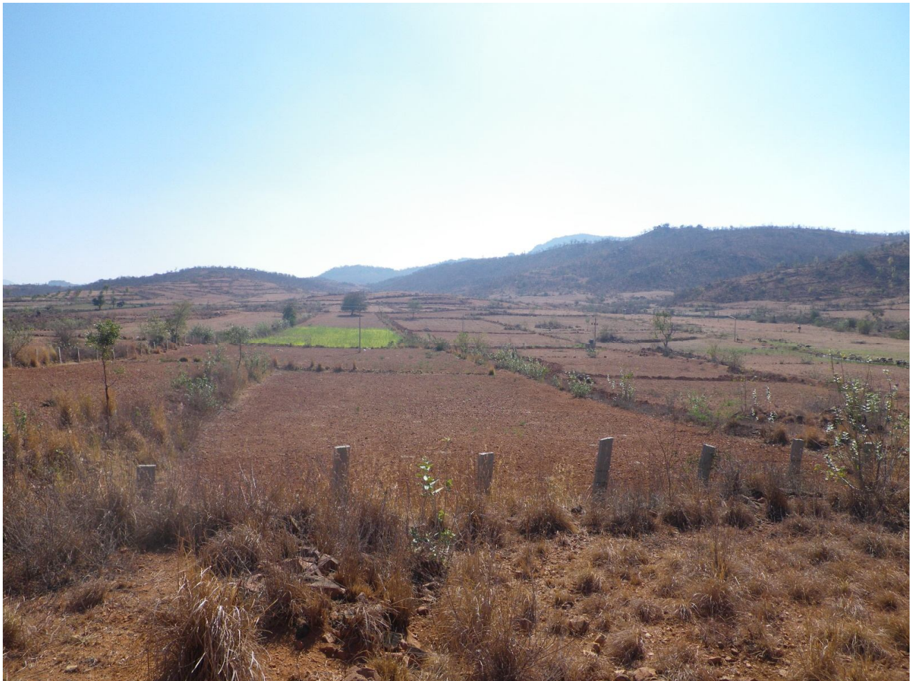
Site for the new Wildlife Center

All other projects are continuing as before within the limits of funding capacity.