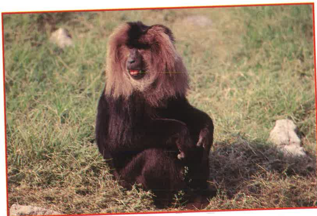
A male LTM in AAZP, Chennai

7. To bring greater transparency in management of zoos and to facilitate exchange of animals for making viable social group, inventory of animals giving details of birth and death, species-wise, was published and distributed among zoo managers, animals welfare organizations, research institutions and other concerned organizations.