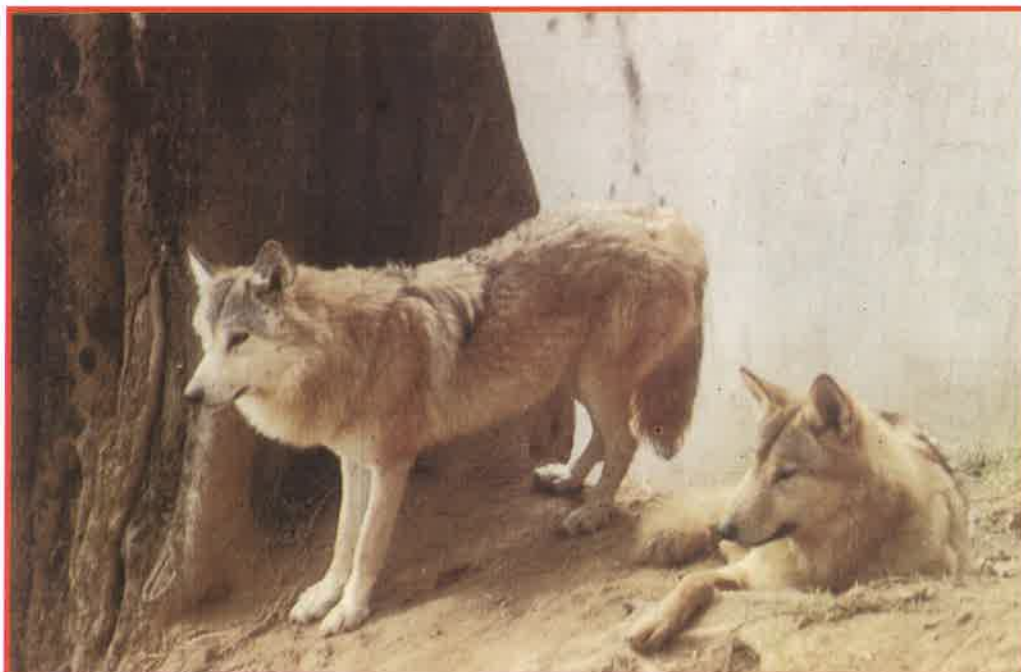
Pic PNHZH Zoo, Darjeeling