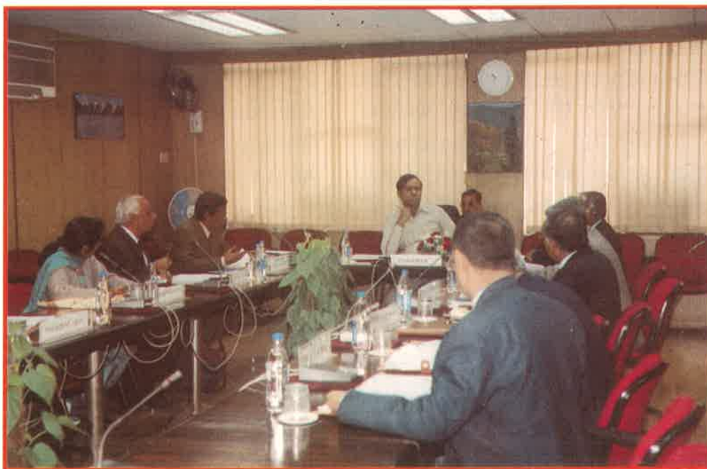
CZA in its meeting

The Member Secretary of the Authority is the Convenor of the Committee.