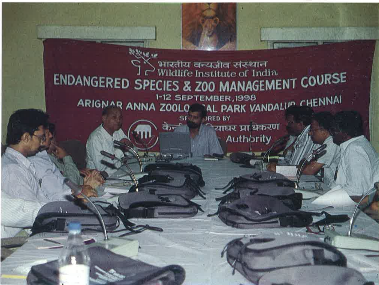
Zoo Directors Training Programme at Vandalur, Chennai.