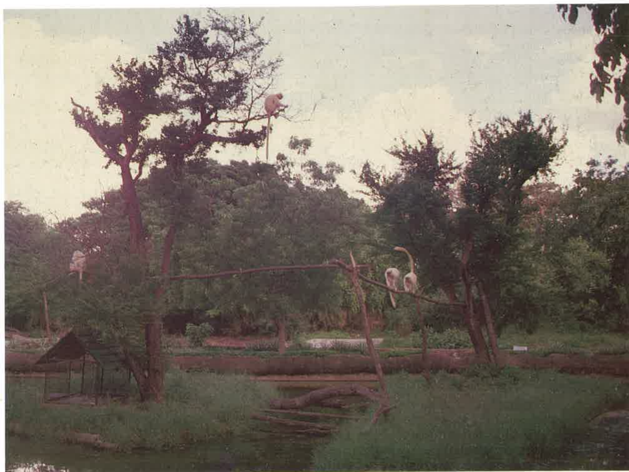
Moated enclosure for Golden Langur at Nehru Zoological Park, Hyderabad.

During the year under report, 18 mini zoos were evaluated. Out of these, following mini zoos were granted conditional recognition: