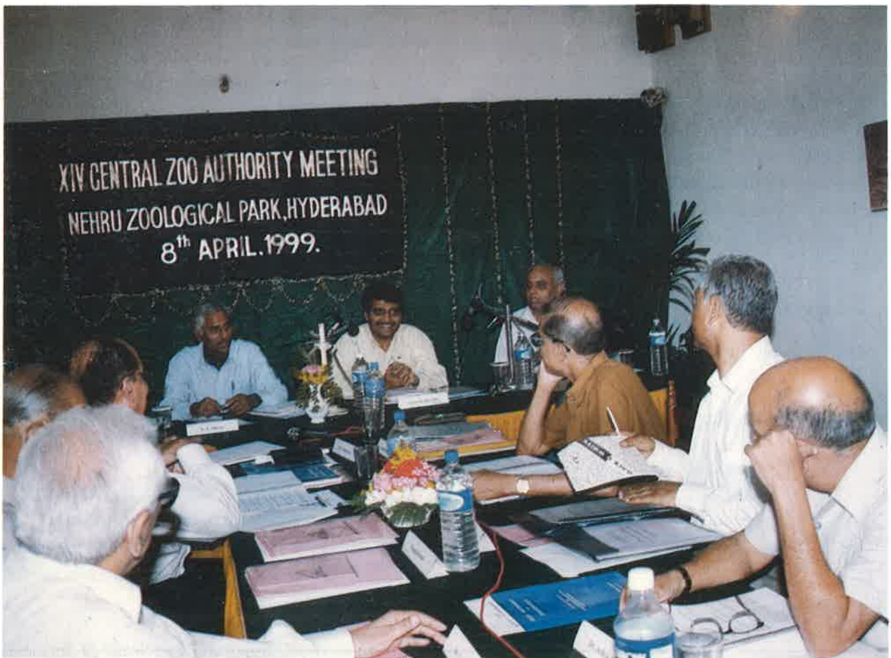
Central Zoo Authority in its meeting.