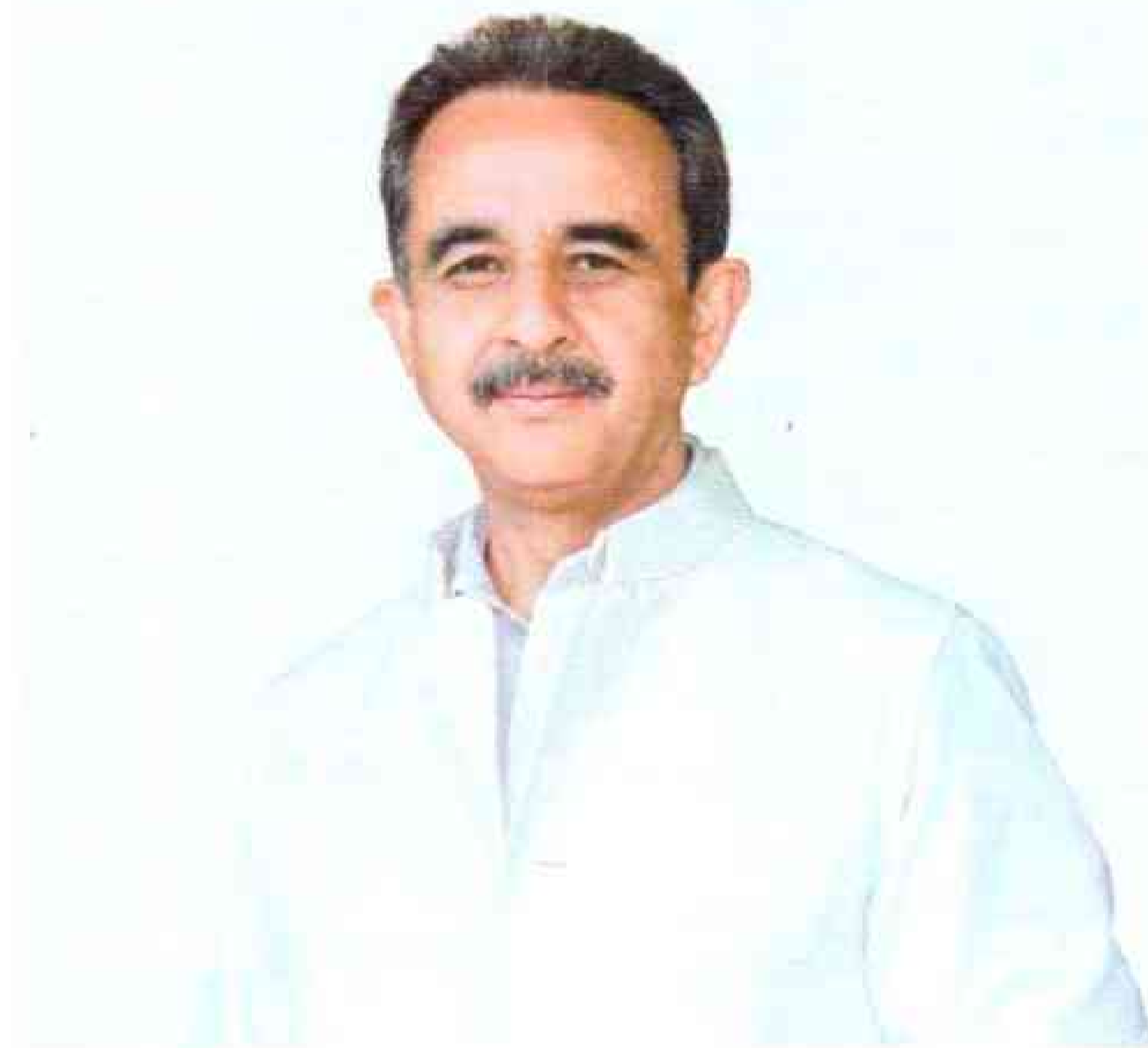
Shri Kirti Vardhan Singh Hon'ble Minister of State for Environment, Forest and Climate Change