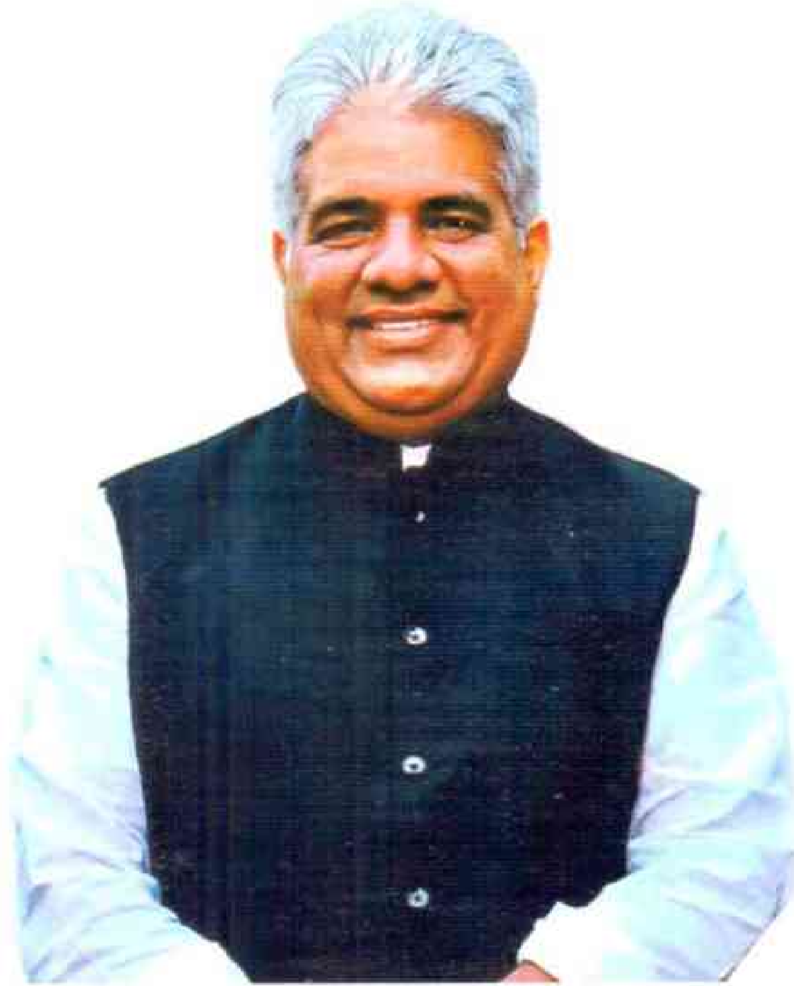
Shri Bhupender Yadav Hon'ble Minister for Environment, Forest & Climate Change