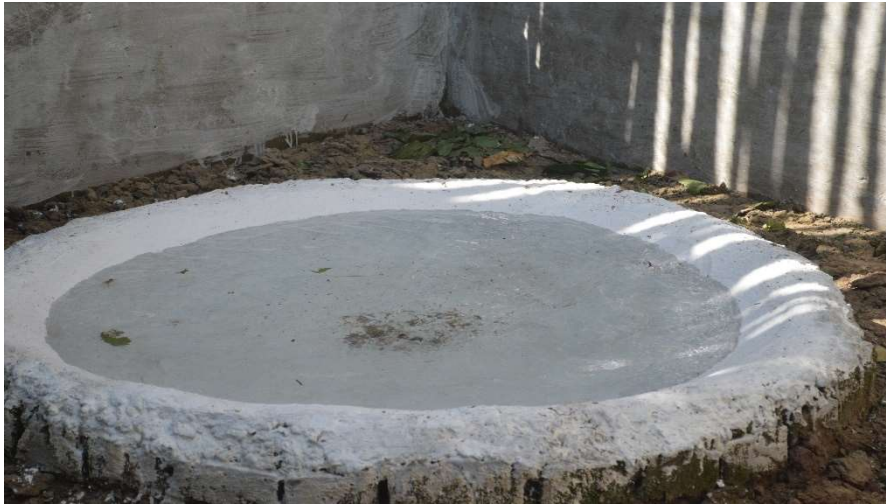
Potable municipal water supply for drinking