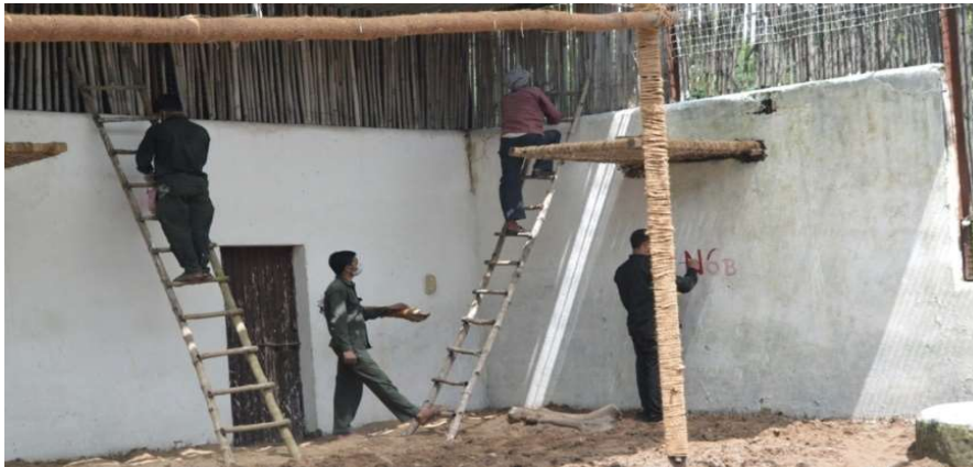
Scrubbing and disinfecting walls with lime