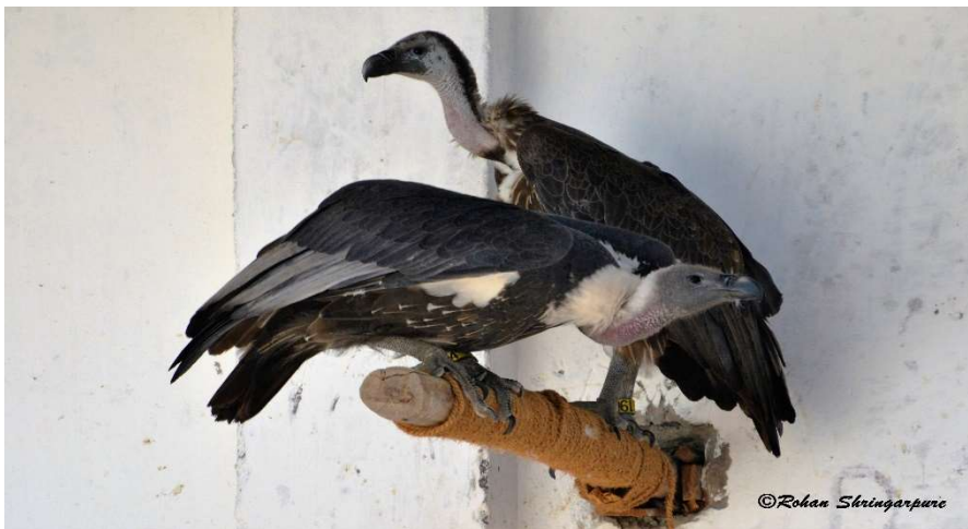
Perches are wound and disinfected every month