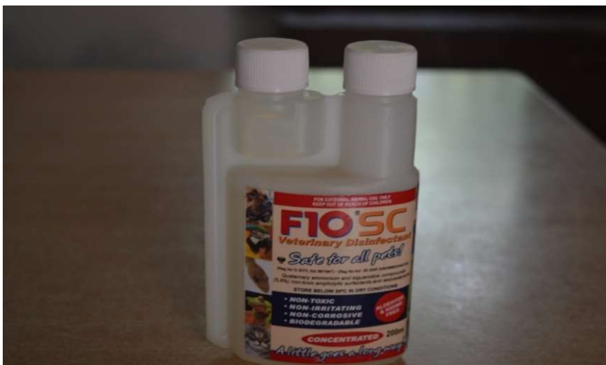
F10, a strong and safe disinfectant