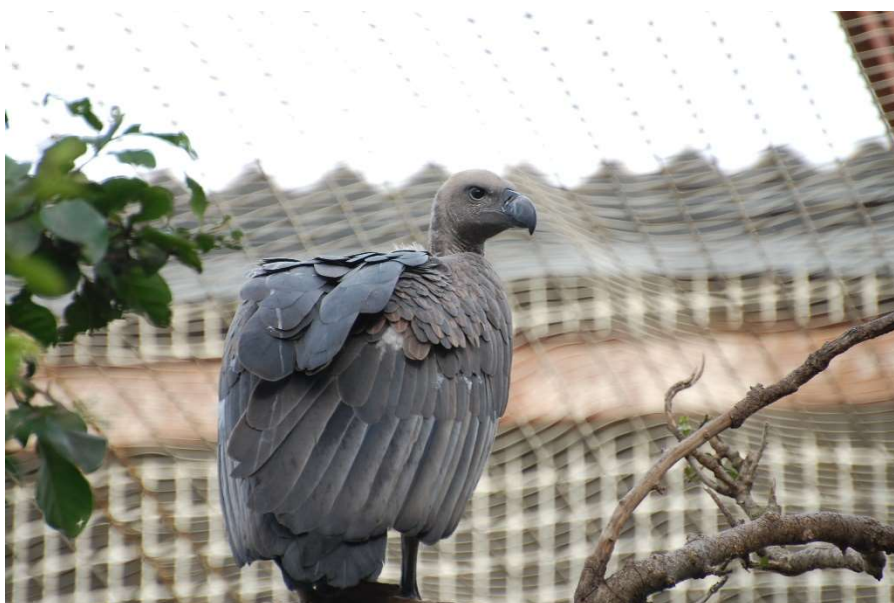
An Oriental White-backed vulture at the centre