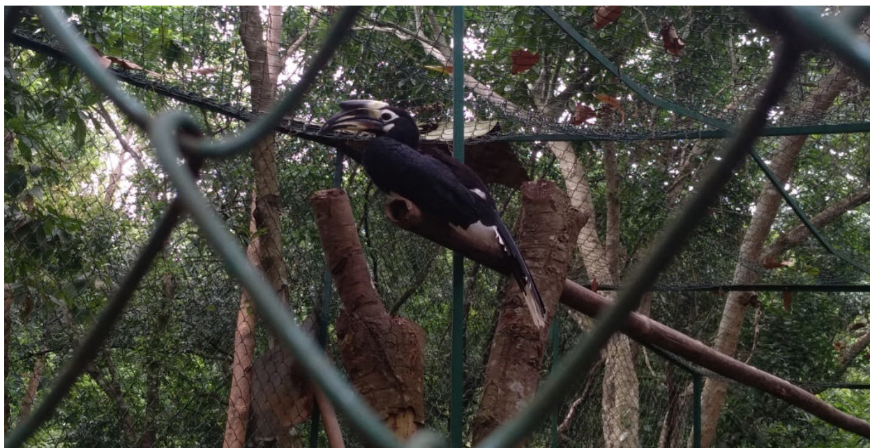
Indian Hornbill (Buceros bicornis)