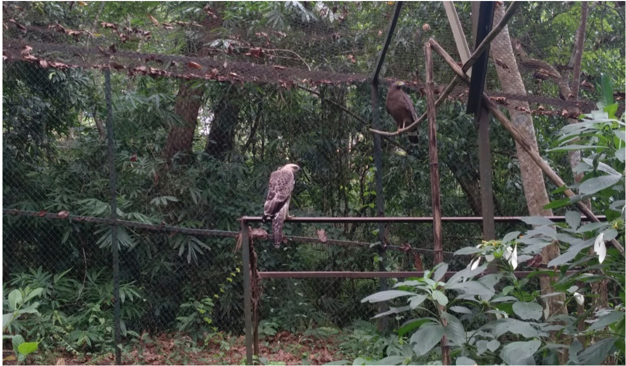
Crested Serpent Eagle

Annual Death Report for the year 2019-20 w.e.f 01-04-19 to 31-03-2020