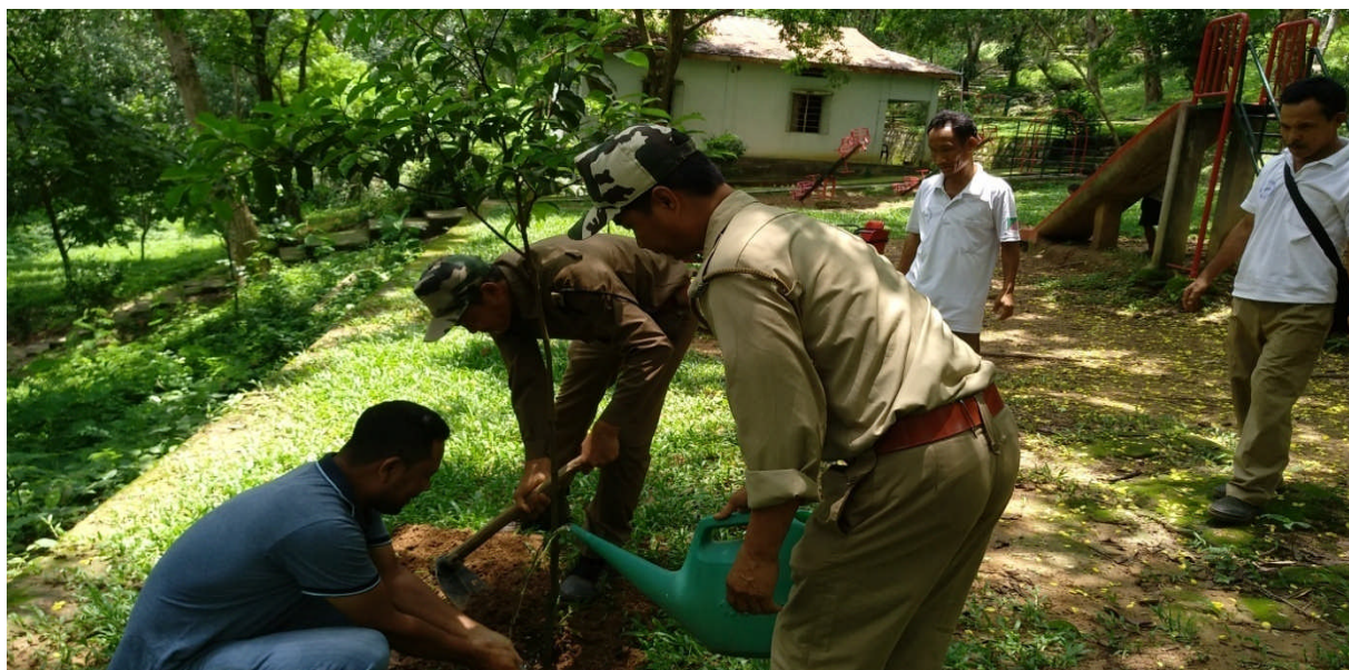
Tree Plantation Drive during World Environment Day