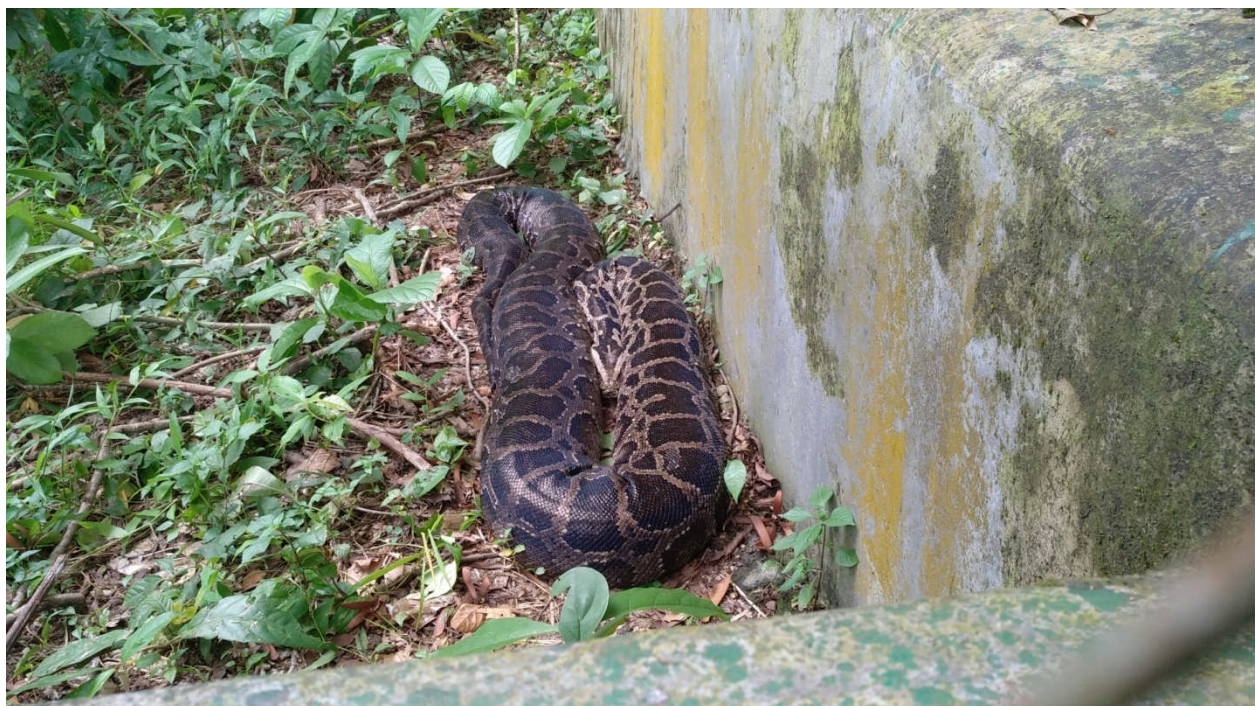
Indian Rock Python (Python molurus)

No animals were acquired/transferred/ exchanged during the year.