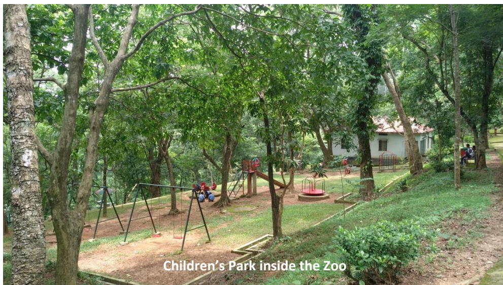
Children's Park inside the Zoo