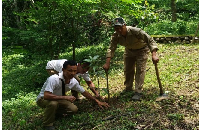
Tree planting during World Environment Day, 2018