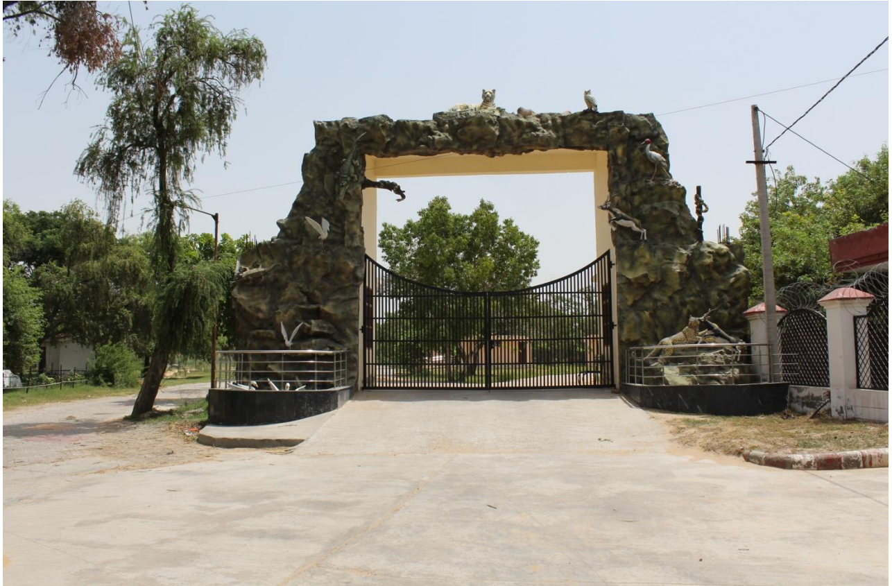
Main Gate of the Rohtak Zoo

2. History of the Zoo – Rohtak Zoo was established in the year 1986 on an area of 7.20 hectares (10 acres) of Tilyar Tourist Complex Rohtak. It is located on the right side on Delhi Rohtak road about 70 Km from New Delhi in Rohtak city. Later on 44 acres of land was transferred from Tourism Department Haryana for the renovation of Rohtak Zoo. The renovation works are still going on and these will take another one or two years to be completed