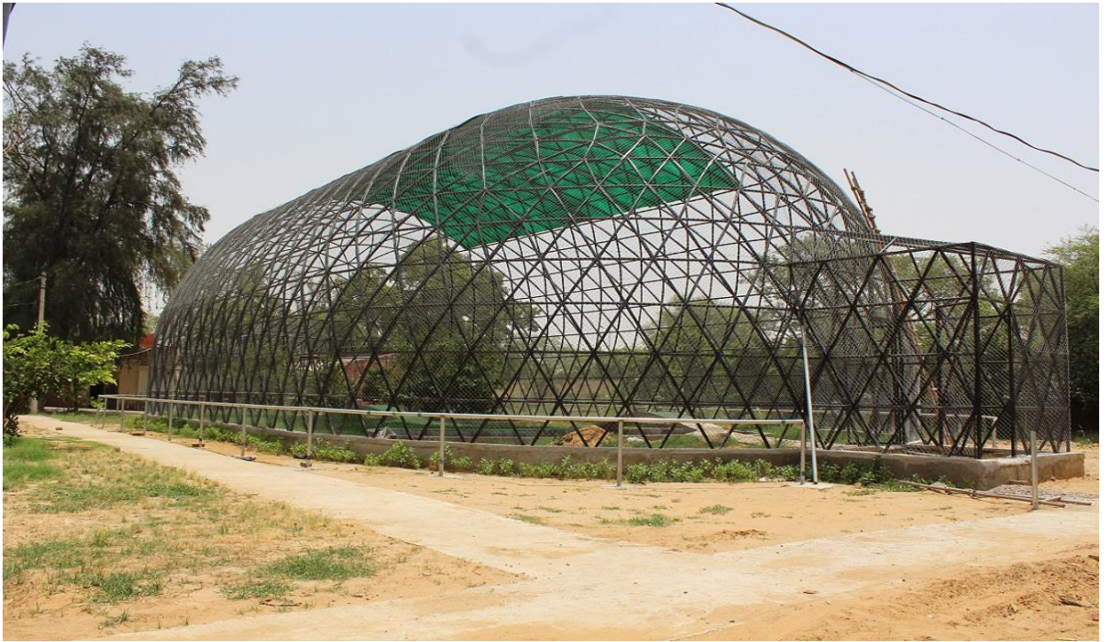
Water Birds Aviary