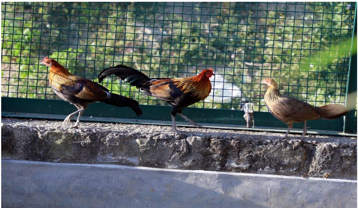
Red jungle fowl