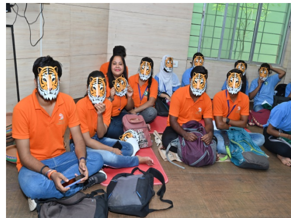
(iii) National Conference of Zoo Biologists (5-7 August 2023)