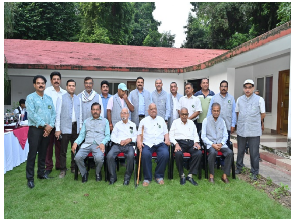
(viii) World Sparrow Day (20 March 2024)