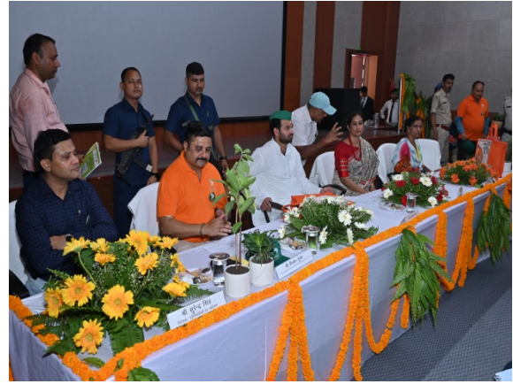
(ii) International Tiger Day (29 July 2023)