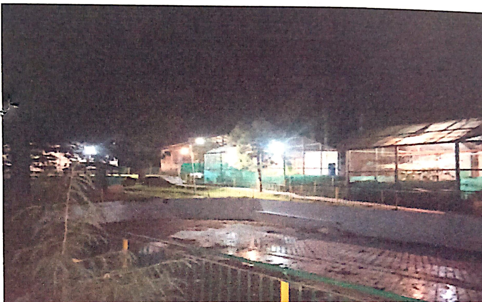
i. Electrification in Nehru Pheasantry