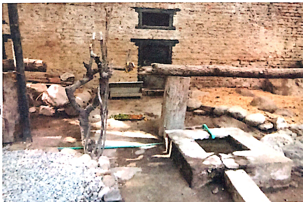
ii. Water supply fitting in Nehru Pheasantry