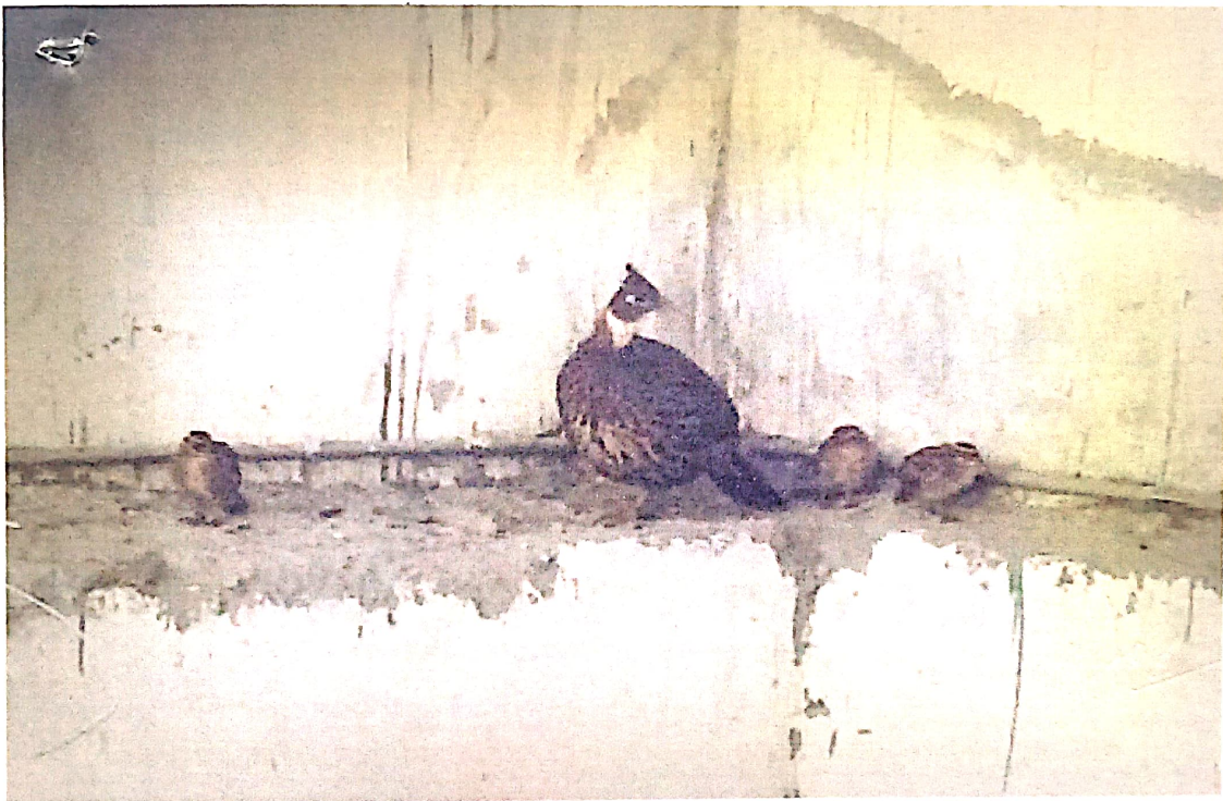
Himalayan Monal / Lophophorus impejanus