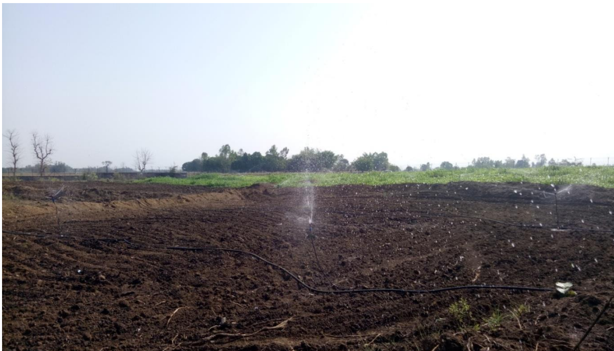
Before : Preparation of land for development of Grassland

1) Grass Land Development: Since in this area the summers are very hot and it becomes very difficult to procure the green fodder for herbivores in summer season. To get rid of this problem, this year we developed a grass land inside the zoo premises to ensure the constant supply of green fodder to the wild herbivores even during the crisis period.