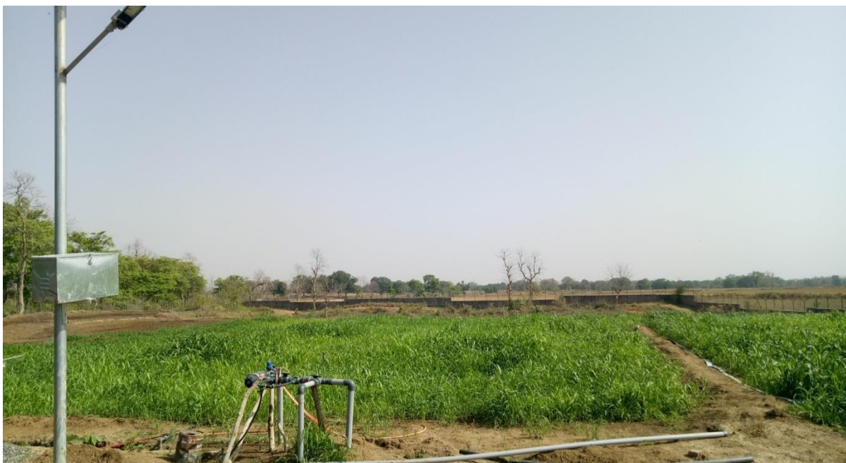
After: Grassland after 25 days of sowing