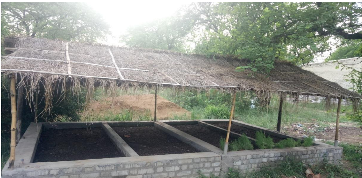
VERMI COMPOST PITS