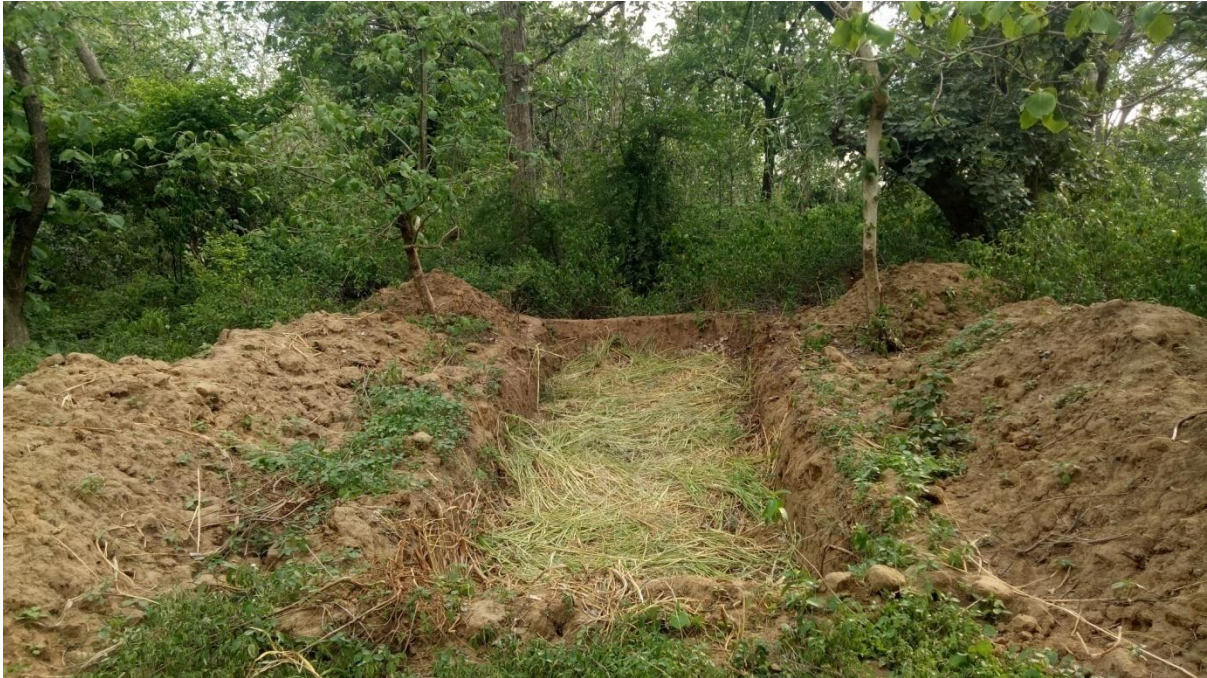
GREEN COMPOST PIT

To run the nursery in an organic manner and to utilize the fallen leaves and other plant biomass, the bio compost and vermi compost pits have been developed. This not only helps in keeping the premises clean, in reducing the fuel load from forested area especially during summer and provides organic manure for nursery and grassland which in turn allows the small fauna like butterflies and other small insects to flourish.