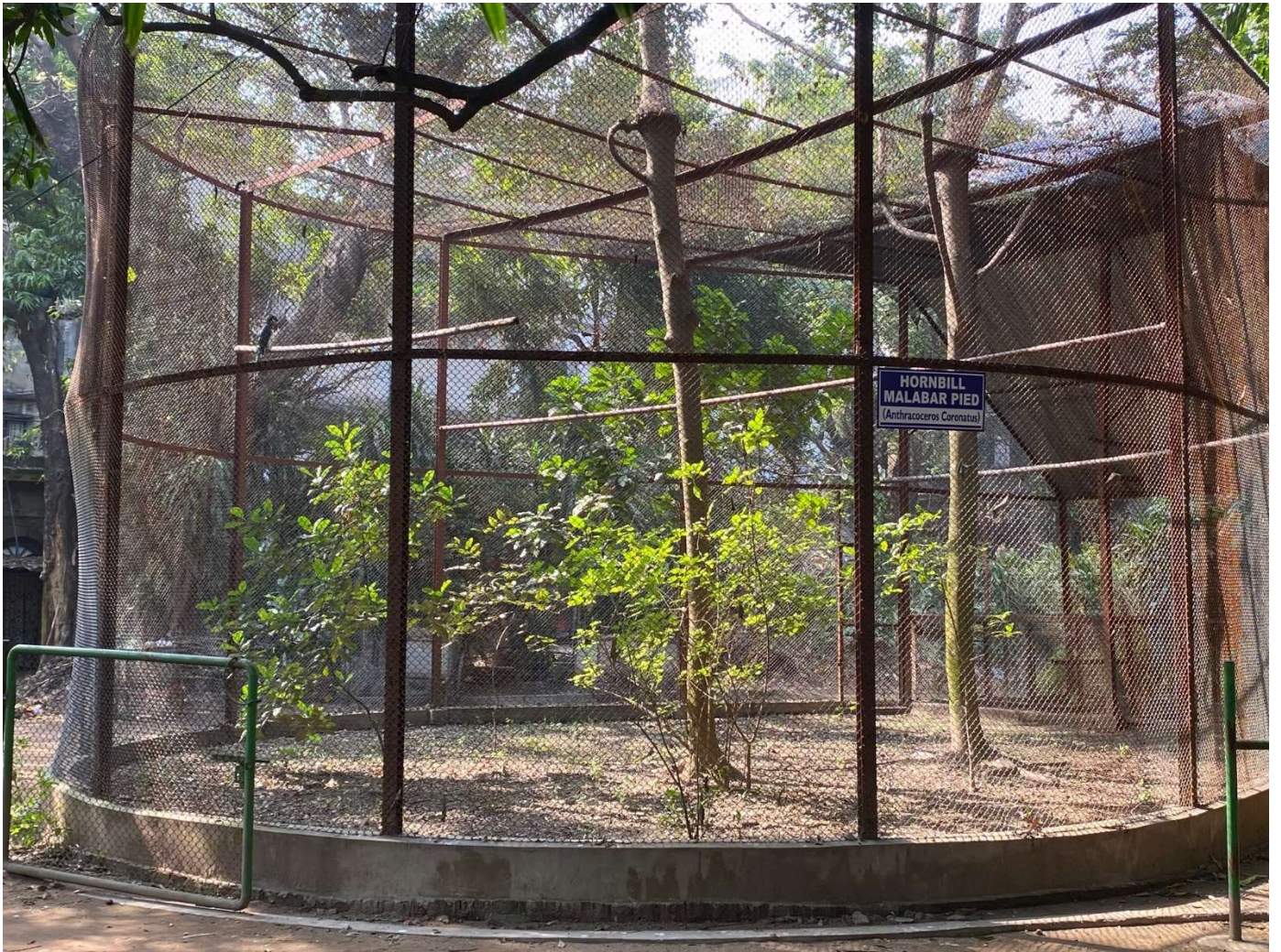
Enclosure for Malabar Pied Hornbill