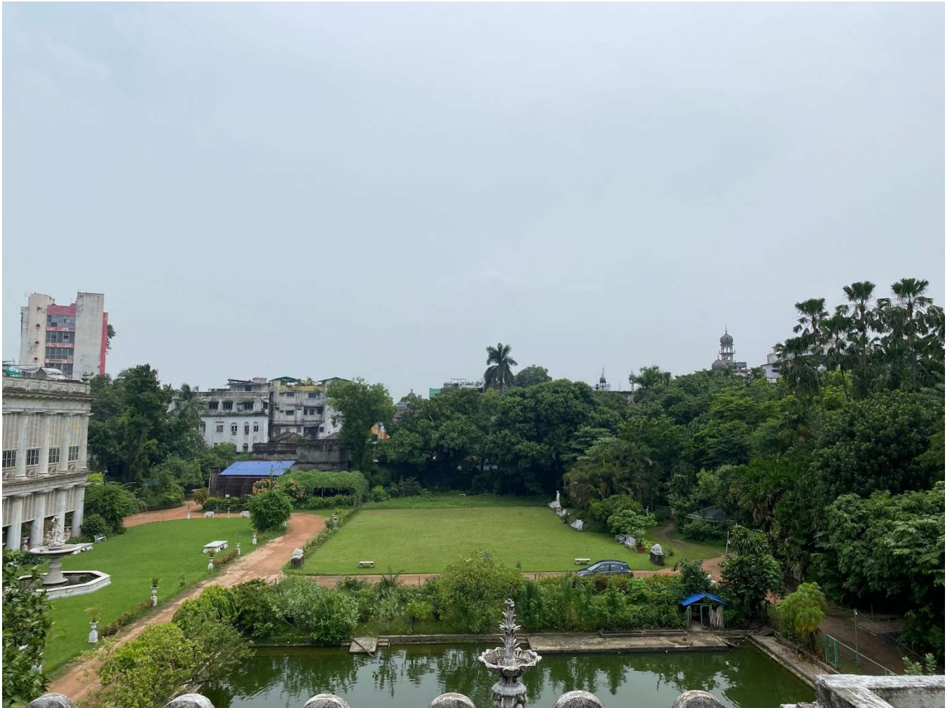
The arial view showing the Palace at the Left side and the Zoo Area in the front and Right side. The lawns are being enjoyed by the visitors as well.