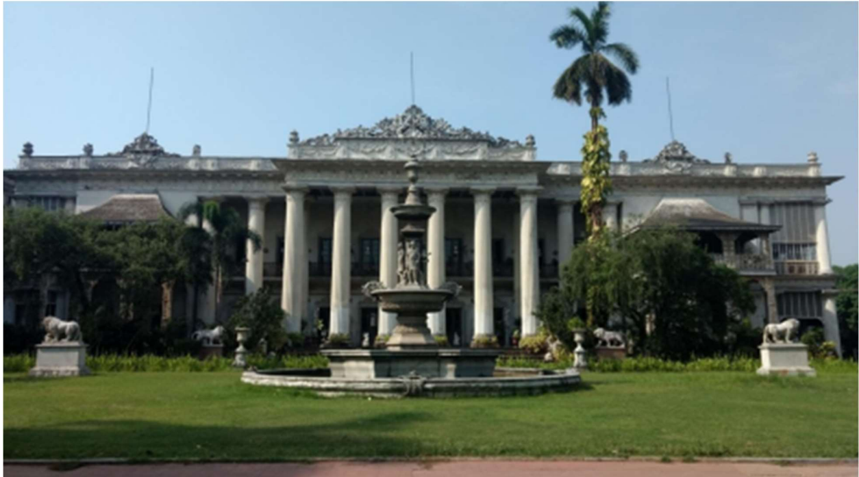
The Marble Palace Zoo and Marble Palace Museum and Art Gallery.