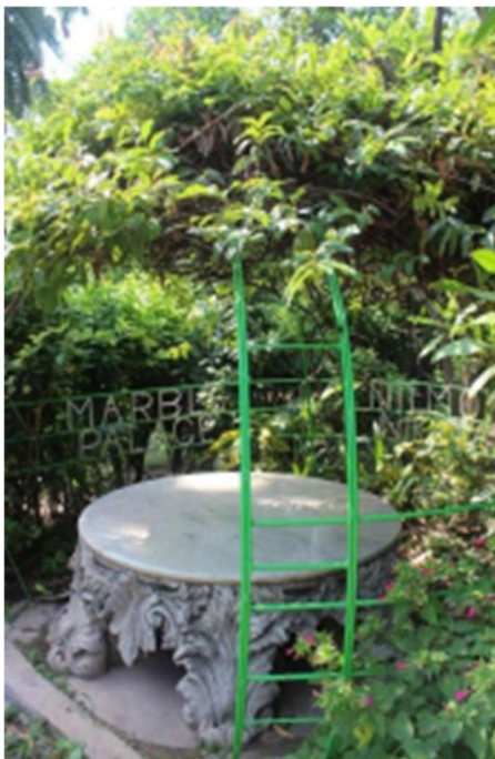
Visitors can sit and relax