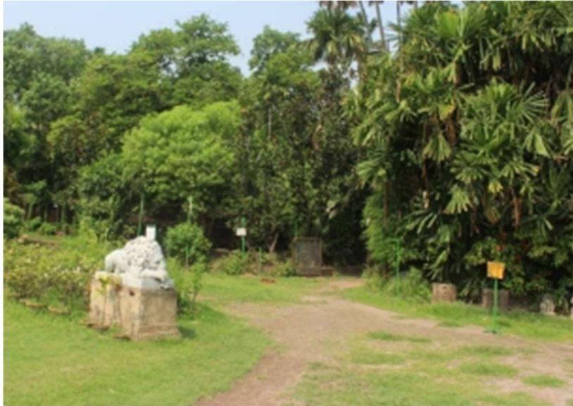
Way to the Zoo

Though it is at urban area, The Marble Palace Zoo Authority are of the opinion to provide the best kind of habitat that can be provided to every animal in natural lifestyle.