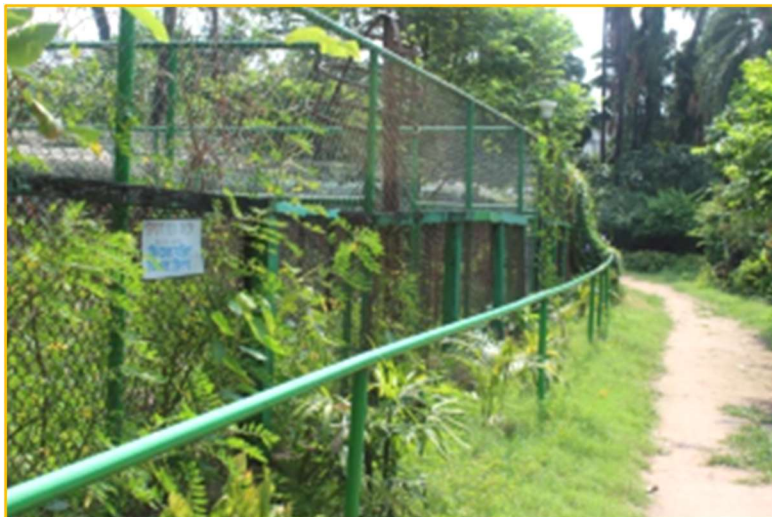
The deer enclosure

The Marble Palace Zoo being a mini Zoo is only concerned and concentrated upon the well-being of the animals and birds. It is the foremost and the most important objective of the zoo. Other objectives of the zoo is spreading of conservation, education and creating awareness among the people