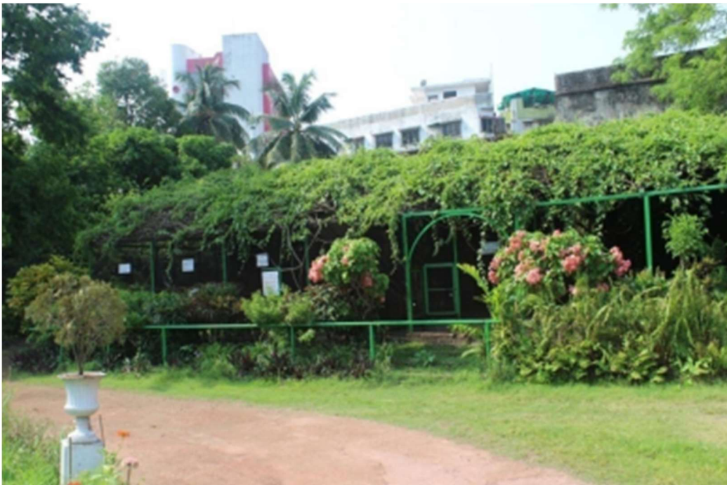
The Zoo Premises