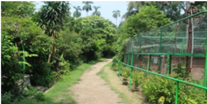
The Deer Enclosure