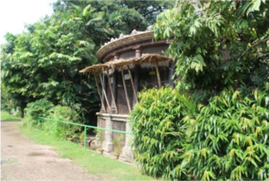
The heritage cage structures.

The visitors can have a combined and enriching experience of the lush heritage so provided by the Art Gallery with that livelihood of the animals and birds.