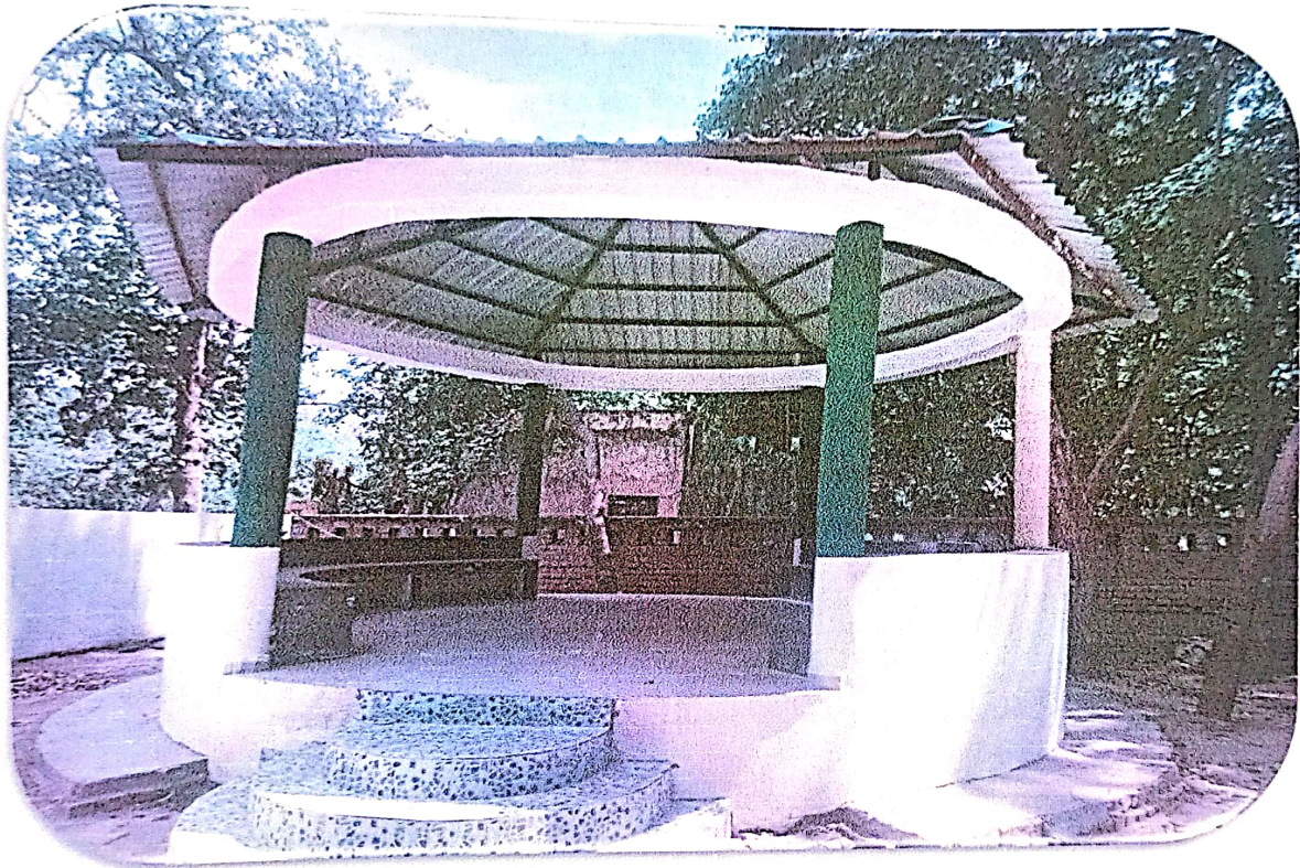
Formation of Visitor Public Shed