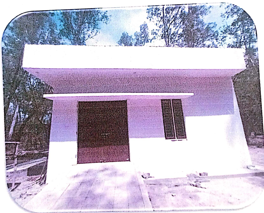
Construction of Treatment cum Postmortem Room