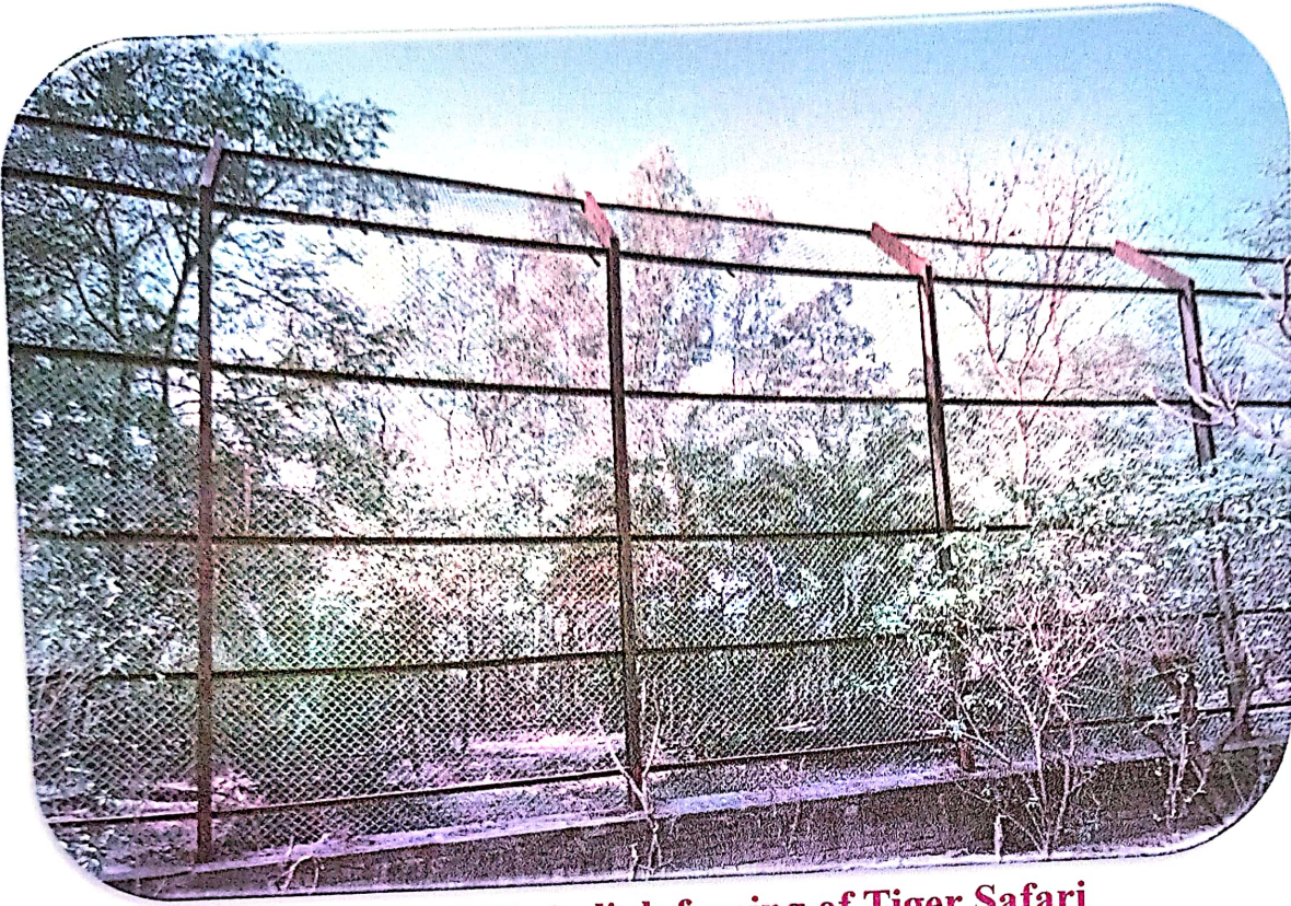
Replacement of Chain link fencing of Tiger Safari