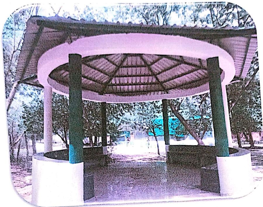
Formation of Visitor Public Shed