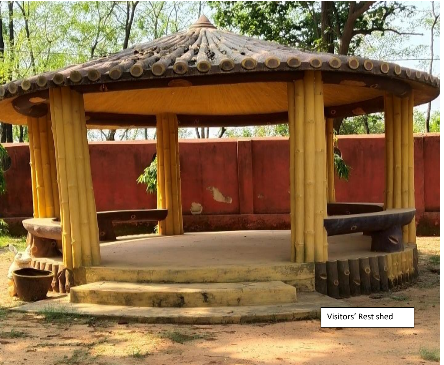
Visitors' Rest shed