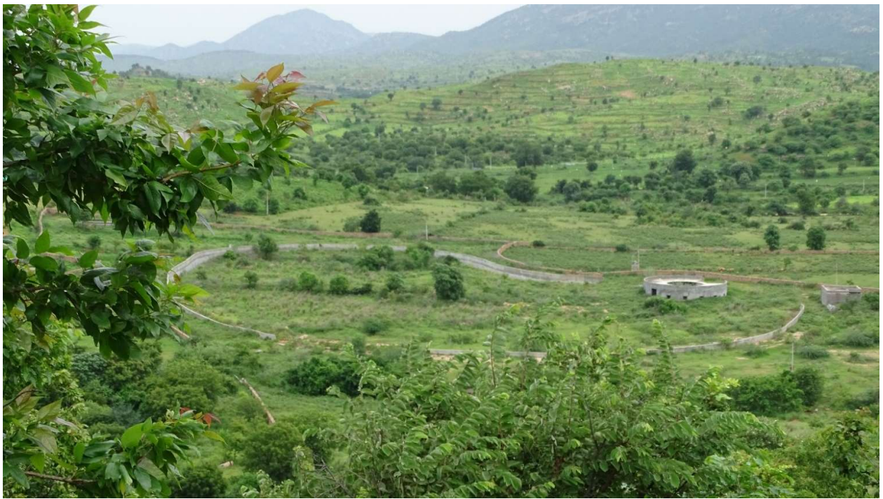
New Karuna Wildlife and Rescue centre