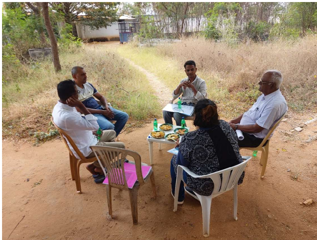
WL Annual Committee meet 2020 -2021