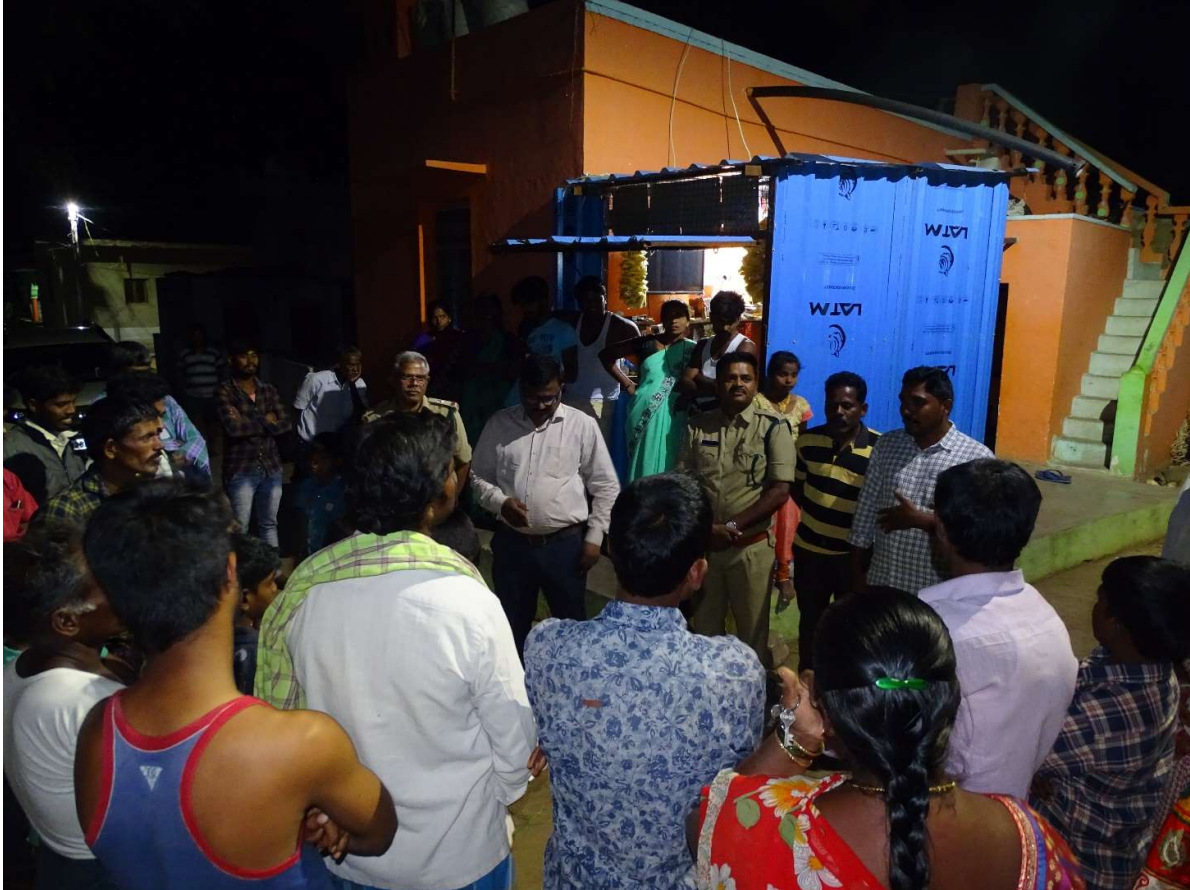
Forest awareness program