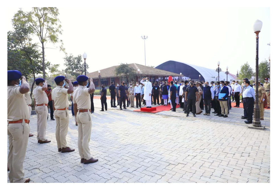
Hon. Chief Minister Shri. Uddhav Balasaheb Thackeray at Gorewada Zoo

Like the world all over the park has faced huge challenge due to Covid-19 pandemic in its first year.