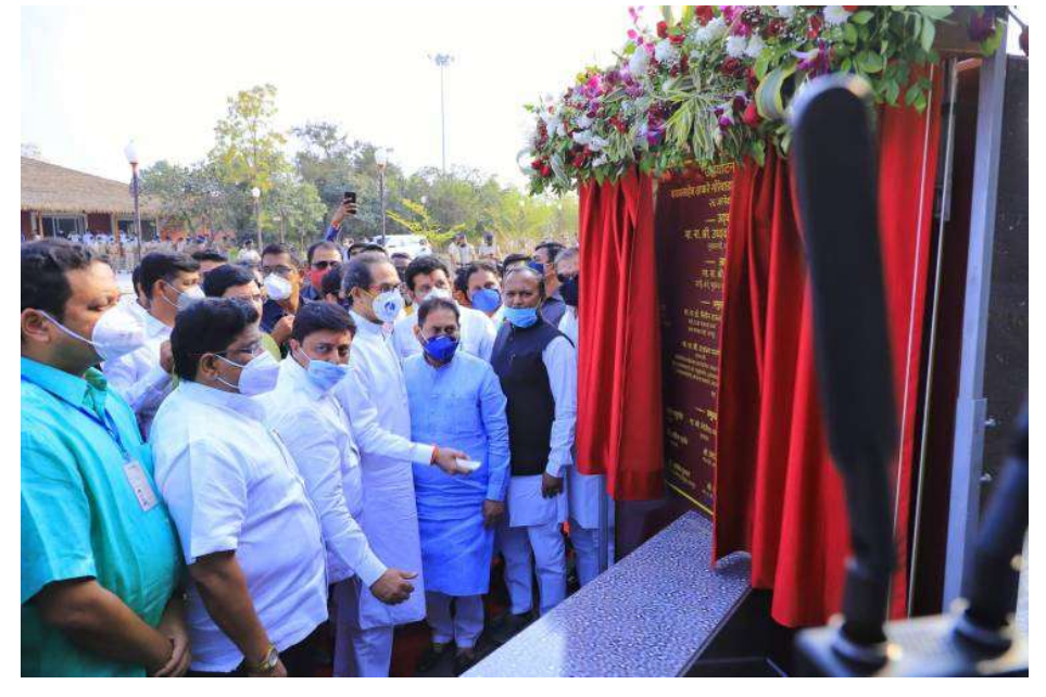
Hon. Chief Minister Shri. Uddhav Balasaheb Thackeray at Gorewada Zoo