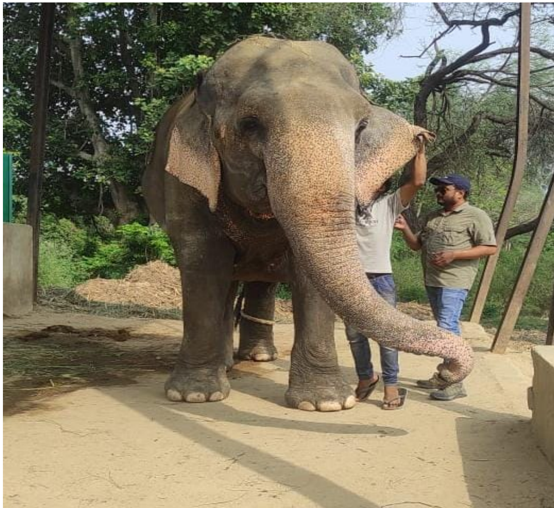
Health Check-up of elephant