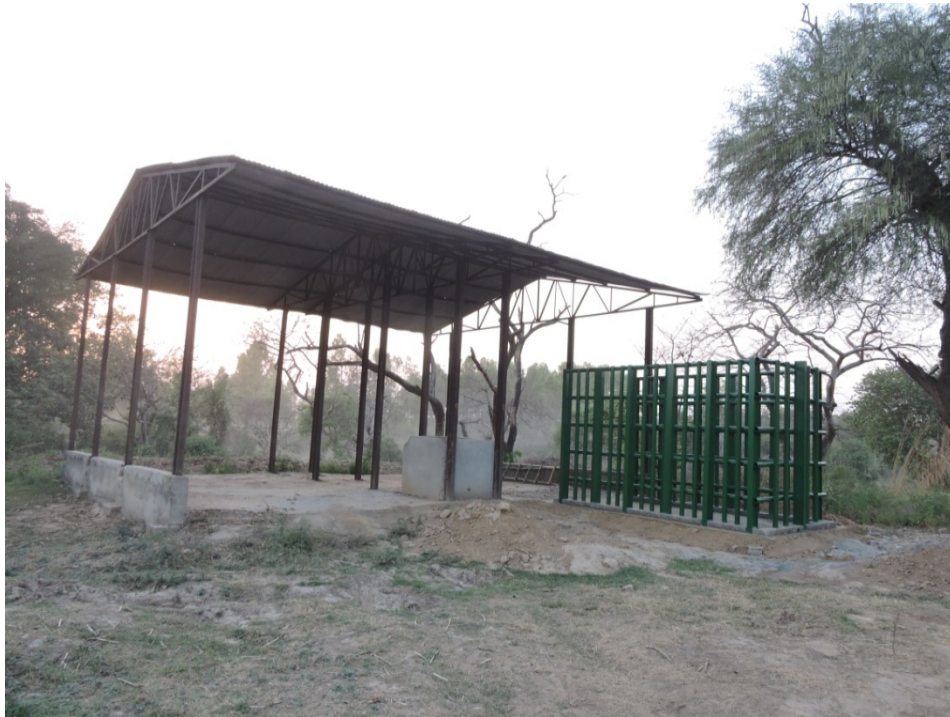
Elephant shed with Treatment -Pan