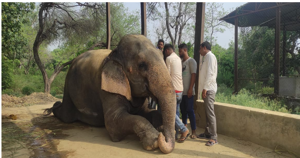
Health Check-up of elephant