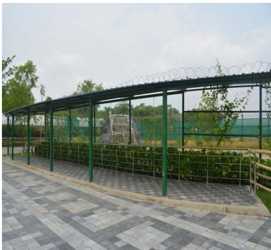
Salt Water Crocodile