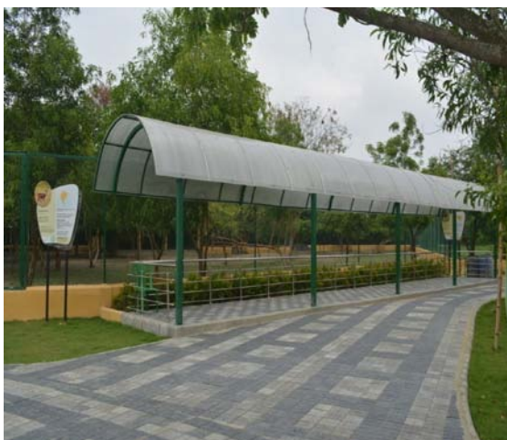
Mixed Deer Enclosure