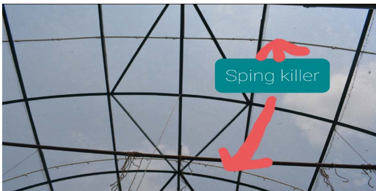
Macaw & Cockatoo