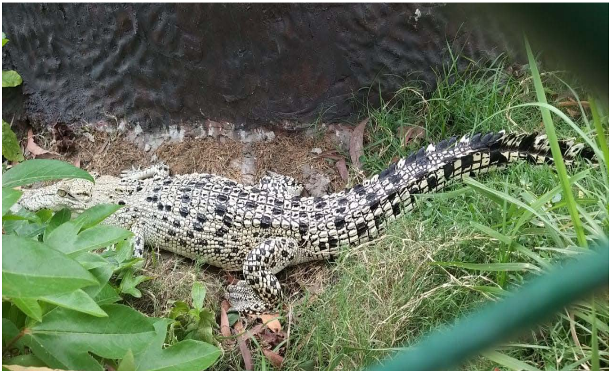
Salt Water Crocodile