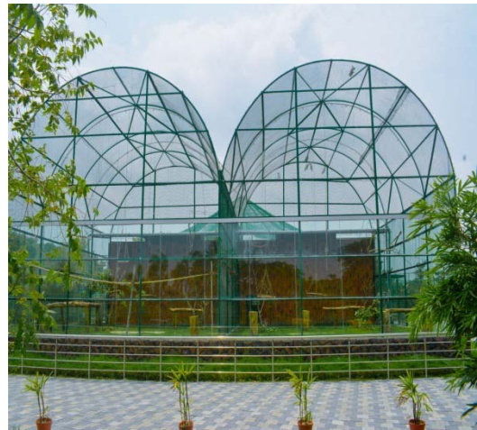
Macaw & Cockatoo