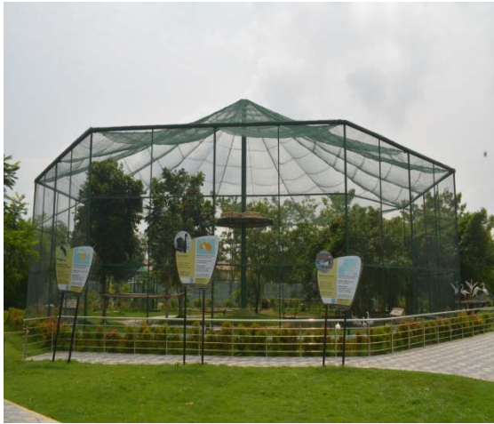
Water Bird Aviary