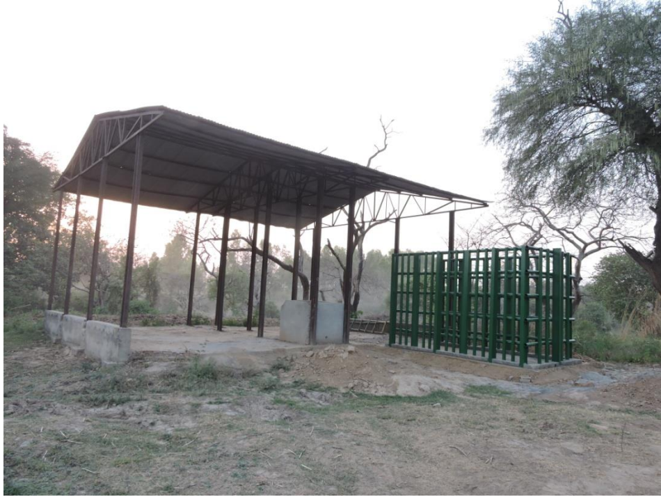
Elephant shed with Treatment -Pan

10. ERC Advisory Committee- Not constituted