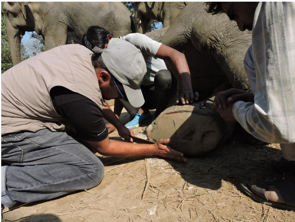
Health Check-up of elephant