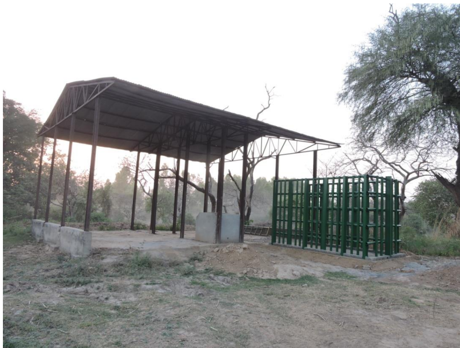
Elephant shed with Treatment -Pan

10. ERC Advisory Committee- Not constituted