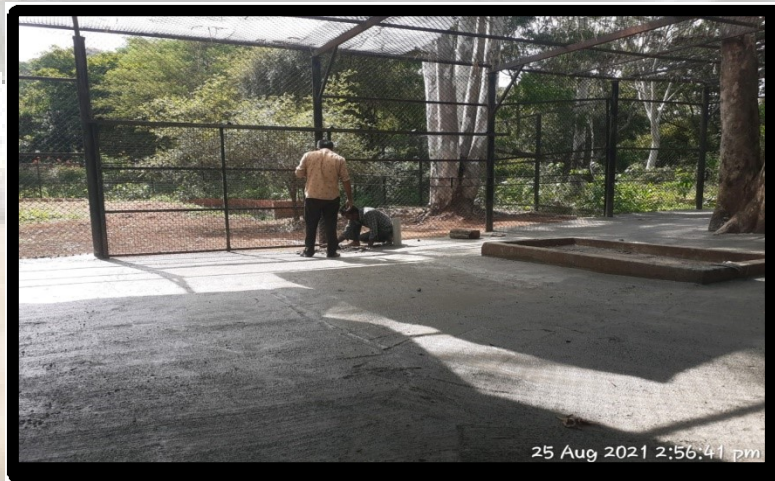
Laying of Concrete Flooring at Black Buck, Spotted Deer and Zebra Enclosures & Day Kraals