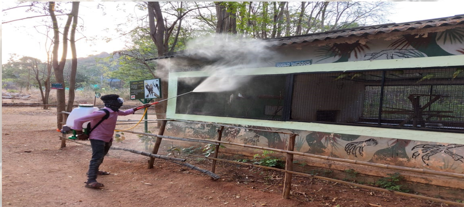
Spraying water to animals and birds in the enclosures in summer and Covid-19 days

Summer Days: More fruits are given to the animals, Electro care Powder is also given to keep them hydrated. Water is sprinkled using sprinklers to keep the enclosures cool during summer.