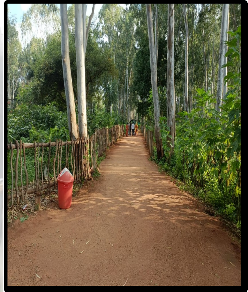
Temporary Wooden Barricades in Visitors Path ways