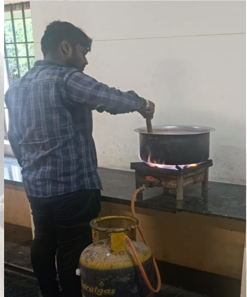
36.10.5(2) cooking by using LPG Gas Stove