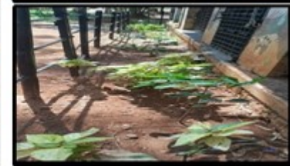
Sl. No : 19 & 20 – Leopard enclosure and Temporary standoff barriers.