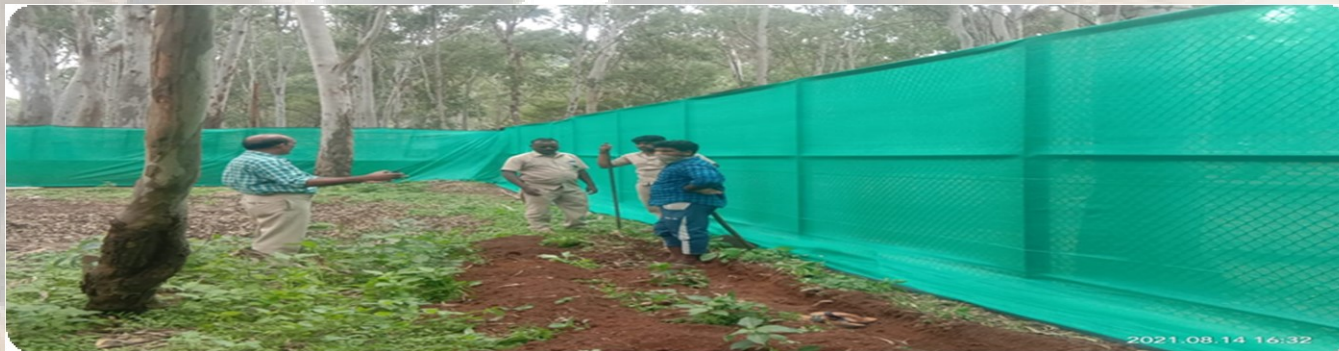
10.1(3) One Side Viewing in Existing enclosure