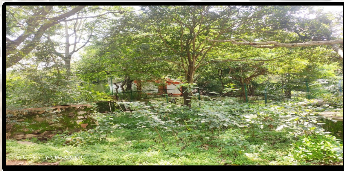
Fencing For Temple Area