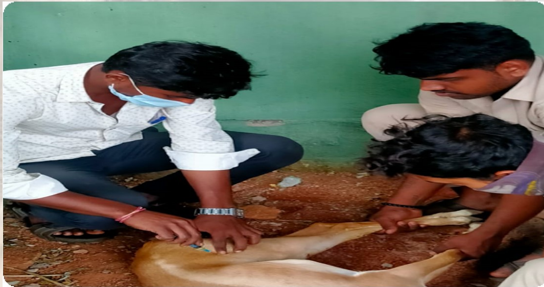
10.1(8) Treatment of Black Buck for skin Infection