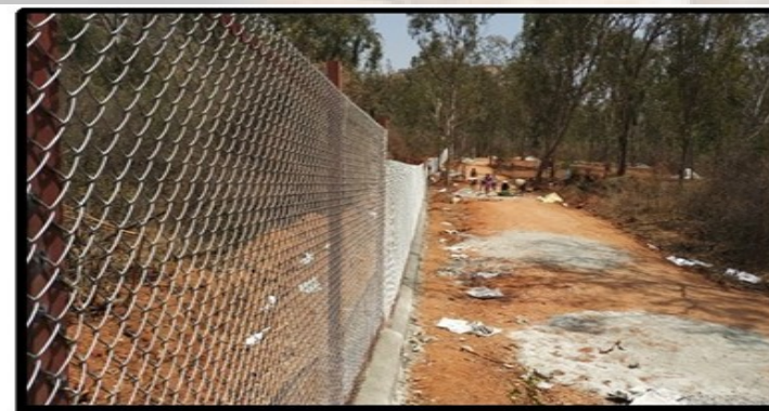
10.1(4) Erection of chain link fencing to prevent entry domestic Cattle into the Zoo