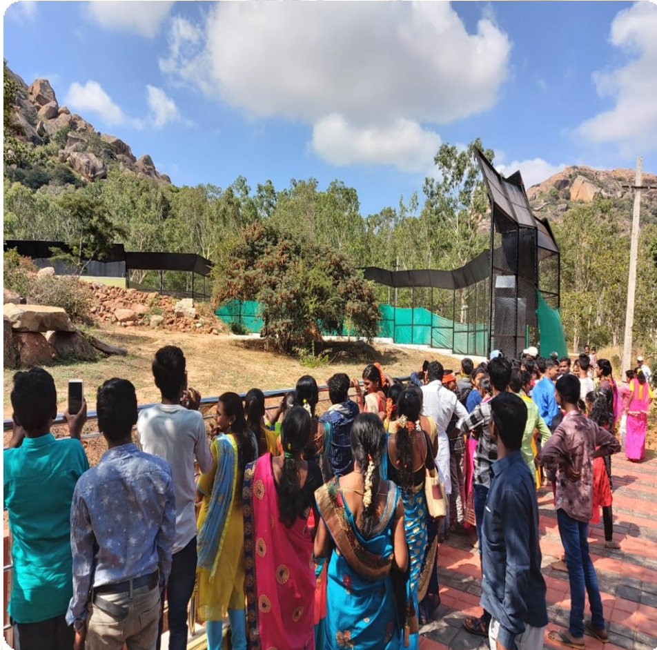
Visitors during Special Occasions