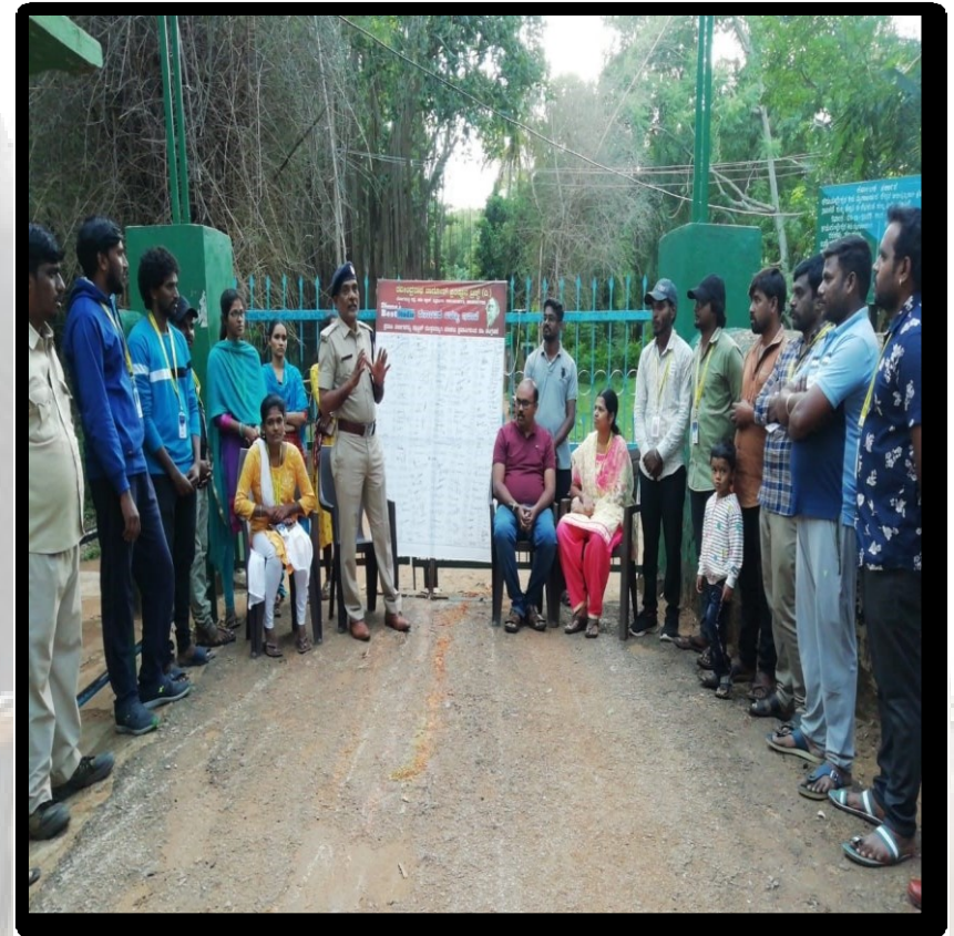
Solid waste management and RFO giving information to trainees and visitors