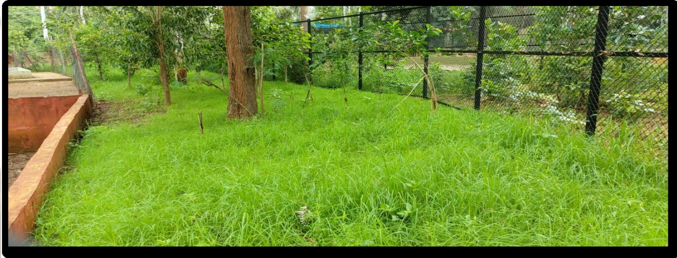
Naturalistic environment in Black Buck enclosures