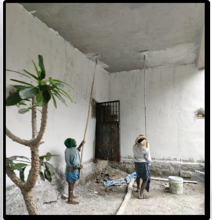
Construction of Birds Enclosure