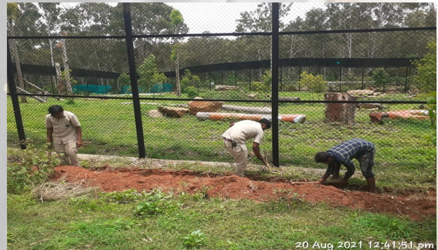
10.4(1) Plantion Activities outside the Entrance and and Enclosures.