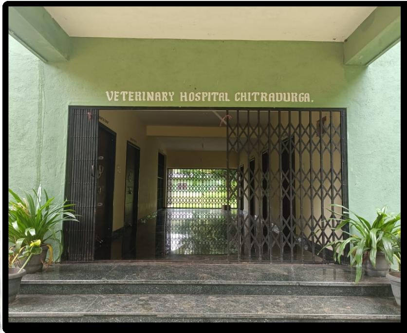
44.106(1b) Veterinary Hospital at Zoo