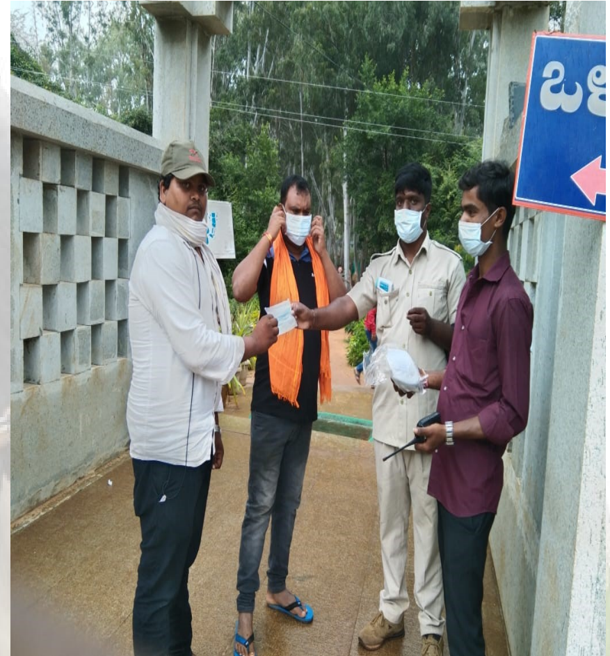
Distribution of Face Mask during Covid Period