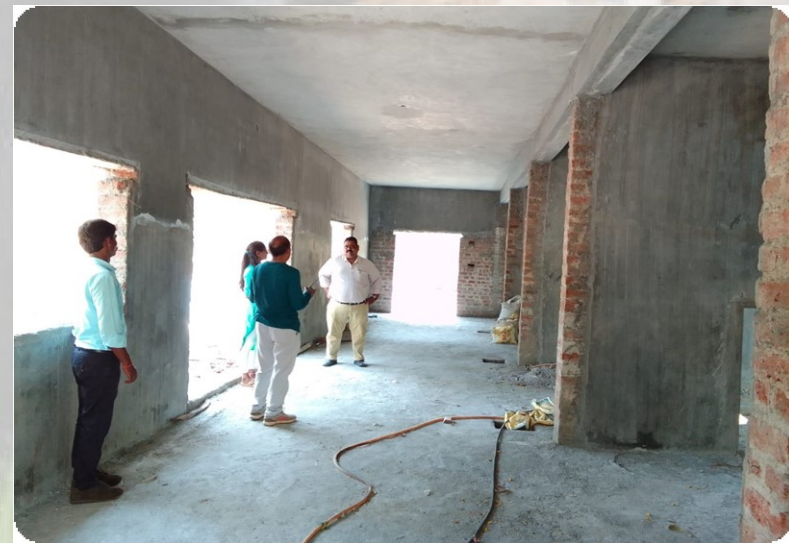
Construction of Tiger Enclosure