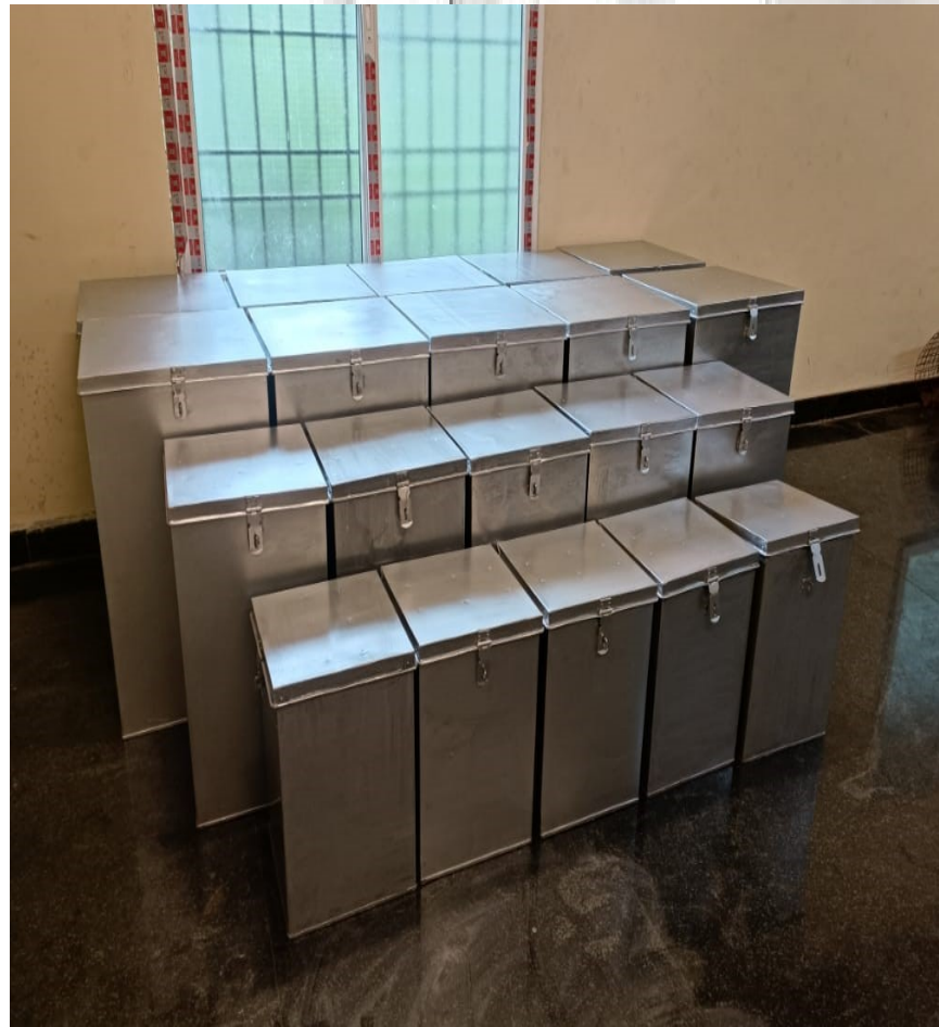
34.10.5(2) Food Storage boxes