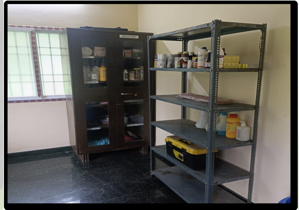
Store room for Medicine for Animals