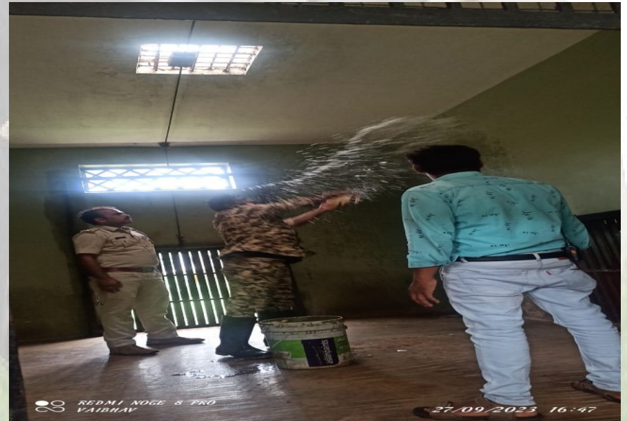
Anti-viral Spray to Animal Holding Rooms