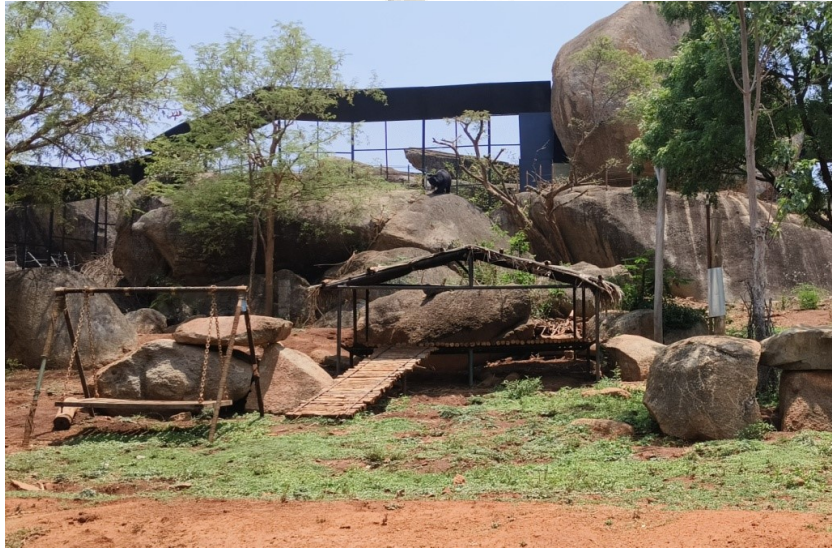
SLOTH BEAR ENCLOSURE

Winter Days: Extra shelters made of grass and screens are provided to keep the enclosures warm during winter season figures are shown below.