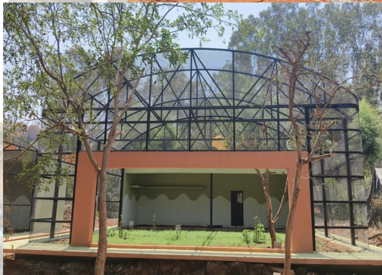
INDIAN PEAFOWL ENCLOSURE