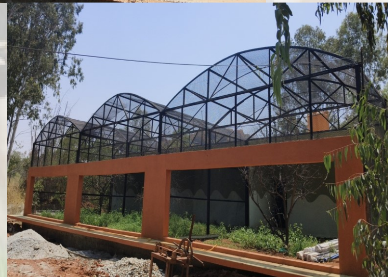
INDIAN BIRDS ENCLOSURE