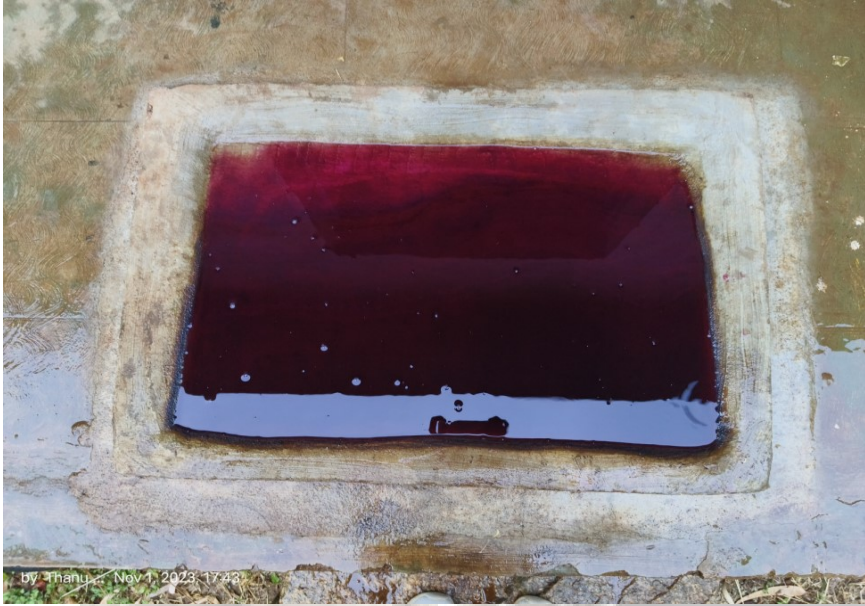
Providing disinfectant foot dips in front of all animal/birds enclosures