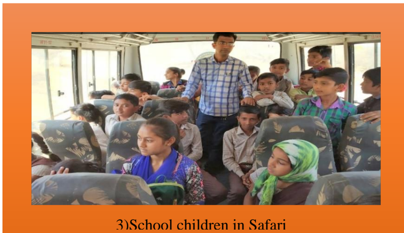
3) School children in Safari