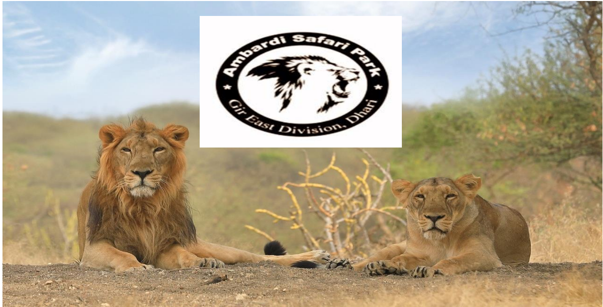
Reception Center Aambardi Safari Park-Dhari.