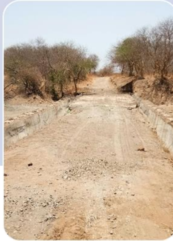
CAUSEWAY NO.2 CONSTRUCTION.