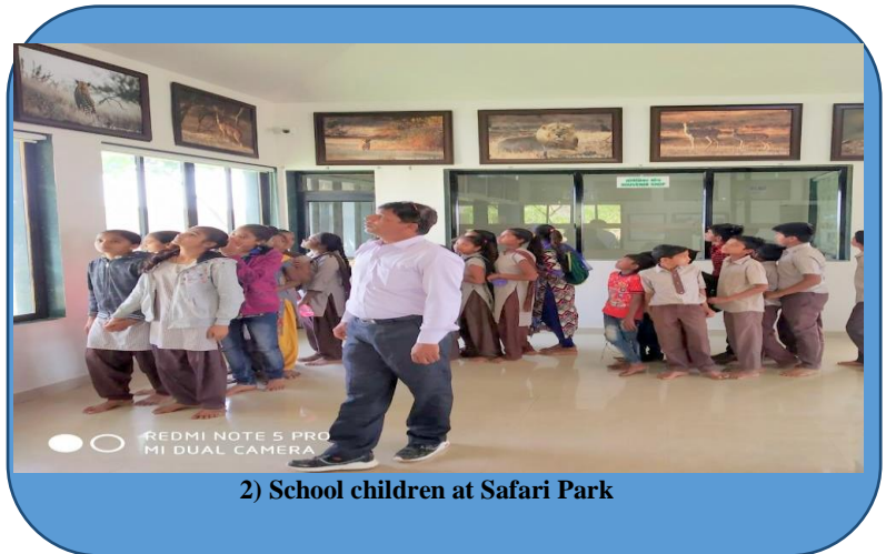
2) School children at Safari Park