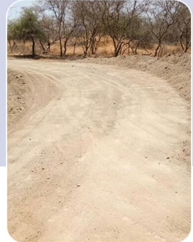
STREEP ROAD IN SAFARI PARK.