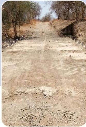
CAUSEWAY NO.1 CONSTRUCTION.