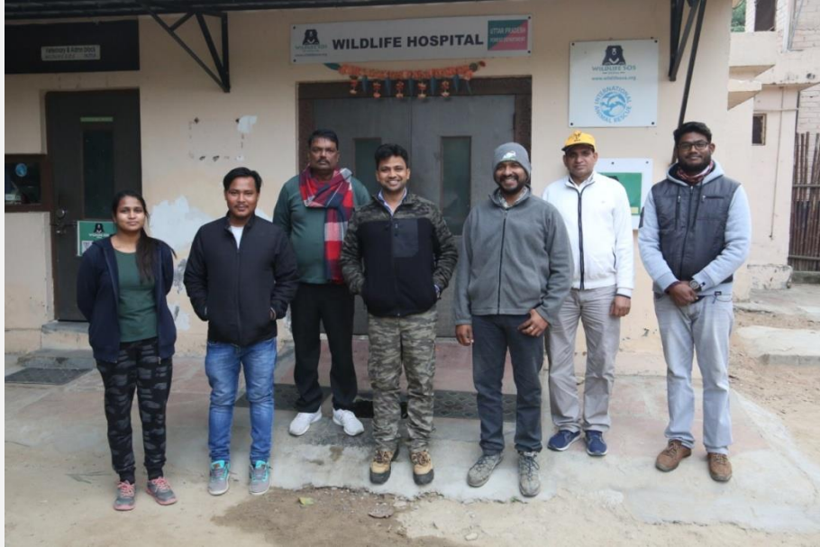
National Zoological Park New Delhi Veterinary officer and Animal Keeper Visit