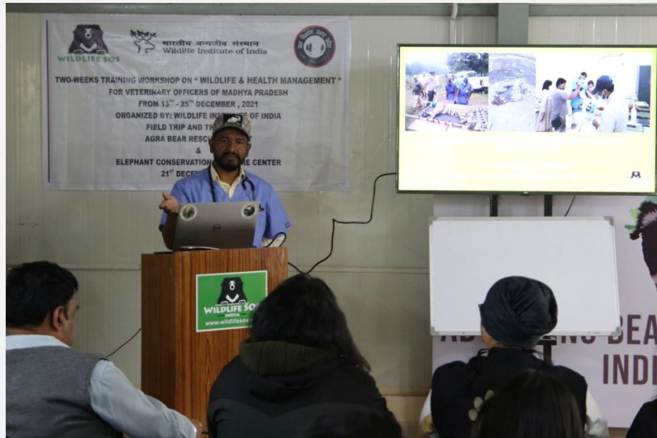
Madhya Pradesh Veterinary officers Field Vist and training - organized by Wildlife Institute of India