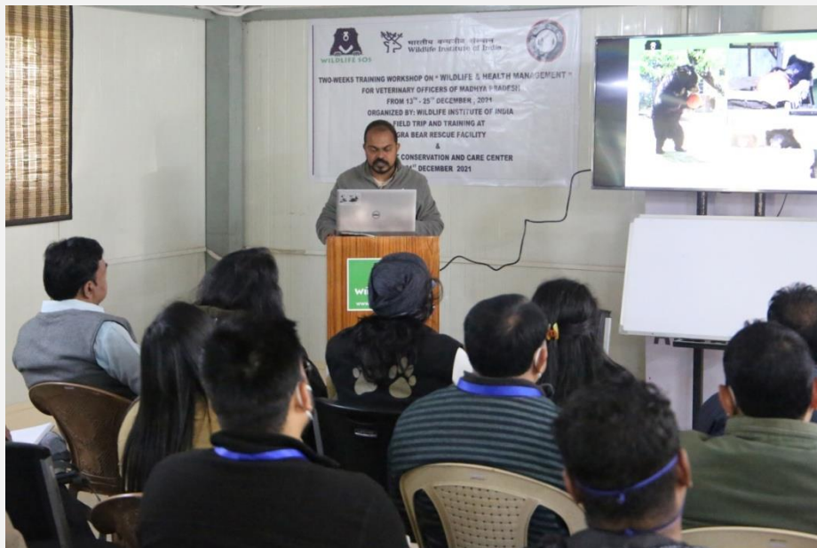
Madhya Pradesh Veterinary officers Field Vist and training- organized by Wildlife Institute of India