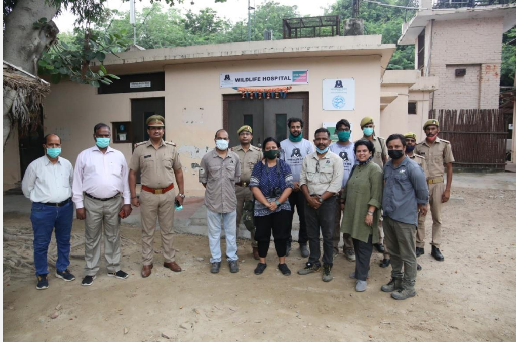
DIG and Veterinary Officer- CZA Inspection Visit