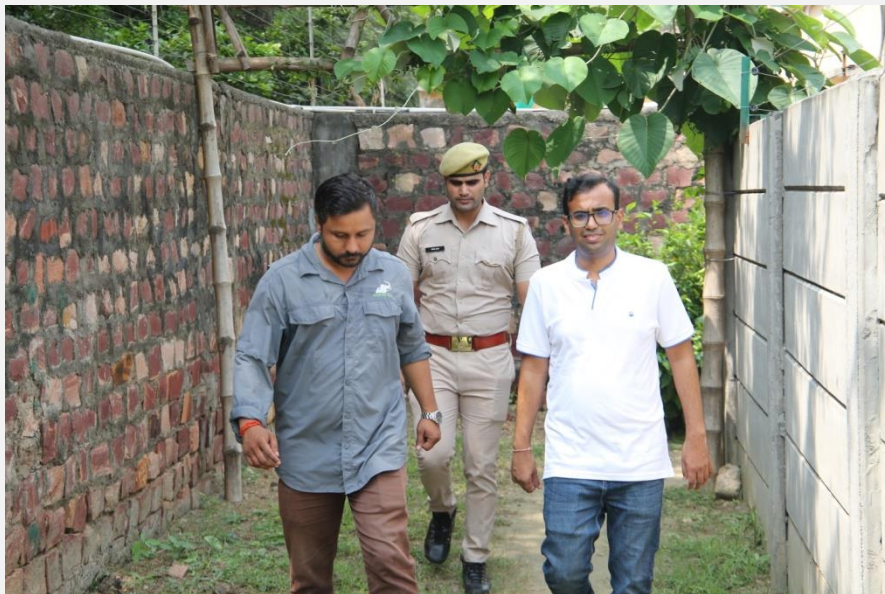
Honourable District Magistrate Etah