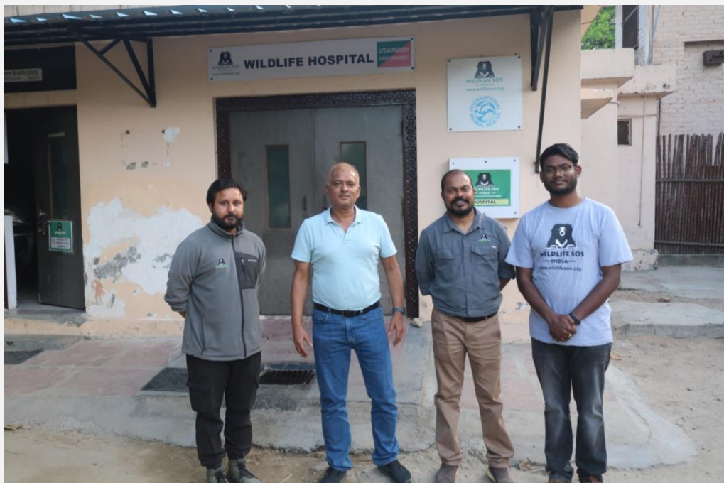
Honourable PCCF & CWLW Tamil Nadu