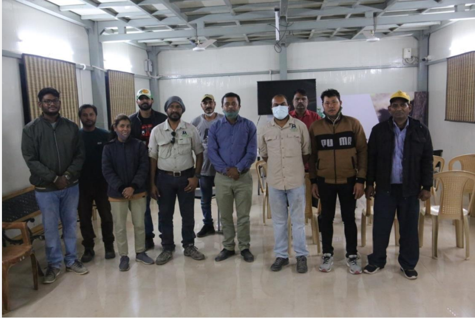
National Zoological Park New Delhi Veterinary officer and Animal Keeper