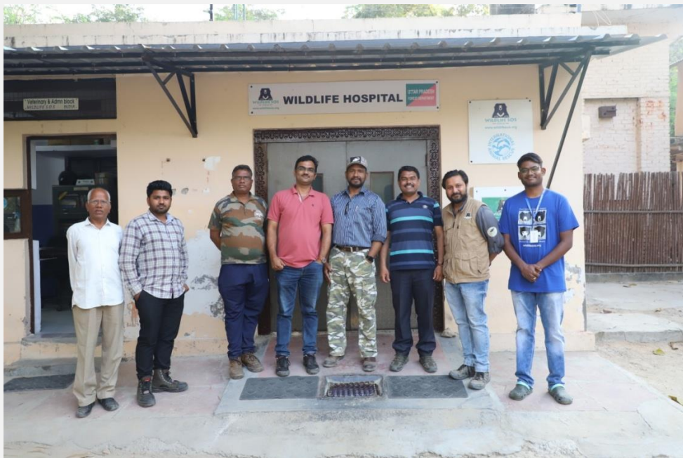
Curator, Vet and Zoo keepers from Balasaheb Thakre International Zoological Park, Nagpur