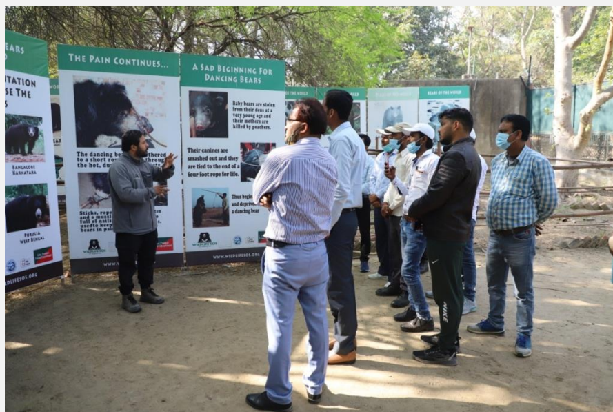
Shaheed Ashfaq Ullah Khan Zoological Park Veterinary officer and Animal Keeper