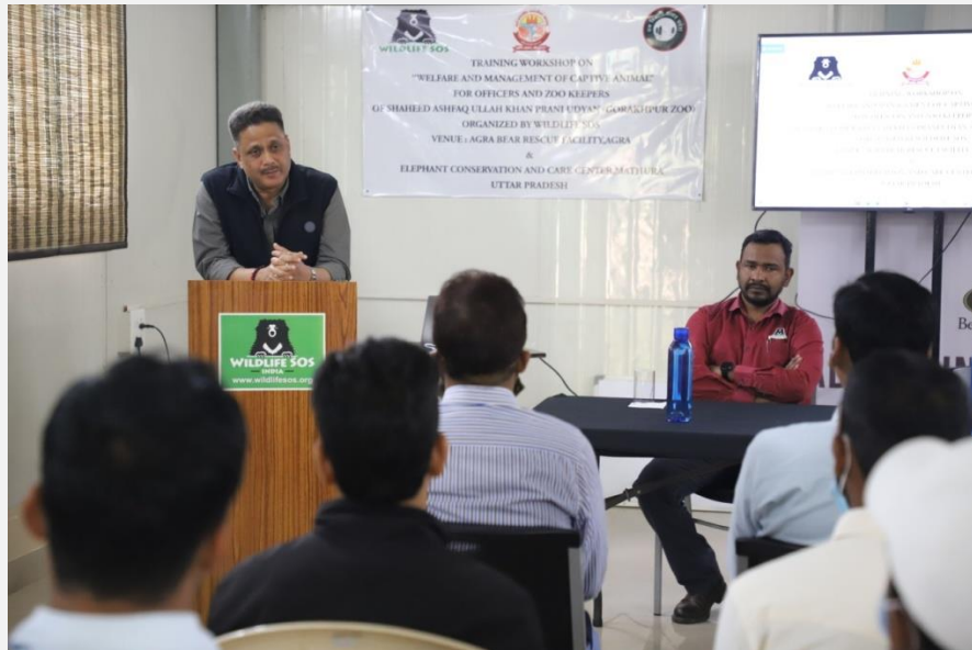
Inauguration session of Training Workshop for officer and zoo keepers of Shaheed Ashfaq Ullah Khan Zoological Park