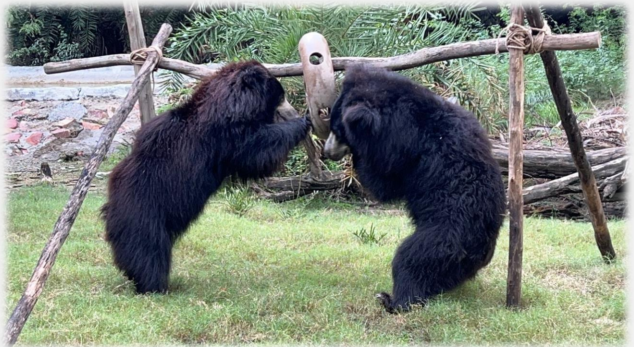
AGRA BEAR RESCUE FACILITY SOOR SAROVAR BIRD SANCTUARY KEETHAM, AGRA, UTTAR PRADESH