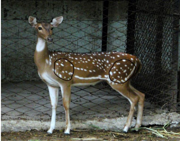
Figure 10: Marked areas on the Axis deer ( Axis axis ) are the preferred sites of intramuscular injection by darting. The preferred areas are the large muscular region on the hindquarters and shoulder.