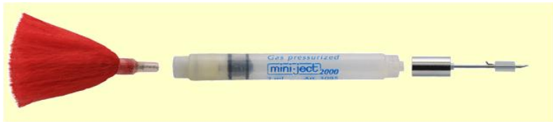
Figure 3: Dart syringes of varying capacity (1 ml to 5 ml) to be darted via blow-pipe

needle hole with a rubber sleeve and fix the needle on the syringe hub. The dart is then pressurized by filling the gas from the rear end of dart and finally the loaded dart is put in the blow-pipe ready for darting.