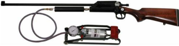
Figure 8: Rifle for immobilization of wild animals