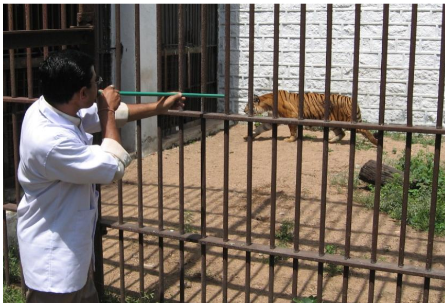
Figure 6: Darting of a captive Tiger using a blow pipe that covers a range of approximately 5 meters.