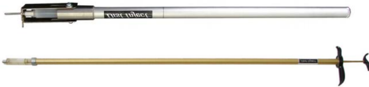
Figure 2: Pole syringe and Jab-stick for immobilization of captive animals

5.2.1. Jab-stick is a modified syringe that allows operator to keep away from animal while injecting the drug. The stick will be attached with a syringe and attached needle. The drug will be administered using a pressure. Different types of jab-sticks, made of aluminum, plastic or fibre glass are available ( Figure 2 ). An extendable jab-stick of 4.5 m is preferred for delivering anaesthetics in captive animals or partially anaesthetized animals. Even the repeated injections of desired doses can be injected using modern jab-sticks.