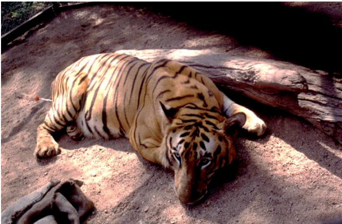
Figure 9: Captive Tiger was anaesthetized with a combination of ketamine-xylazine using a dart syringe projected via a Blow-pipe