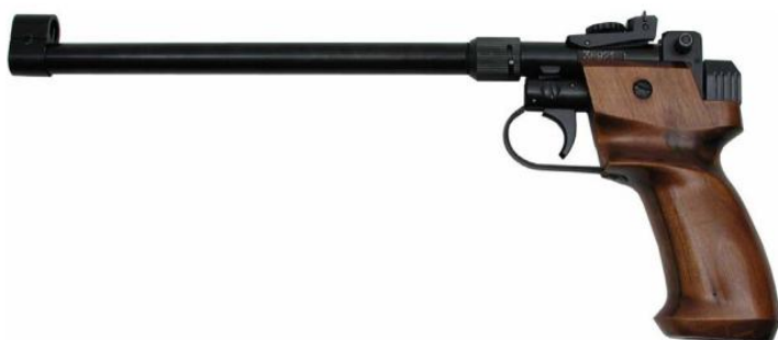
Figure 7: Pistol for immobilization of wild animals