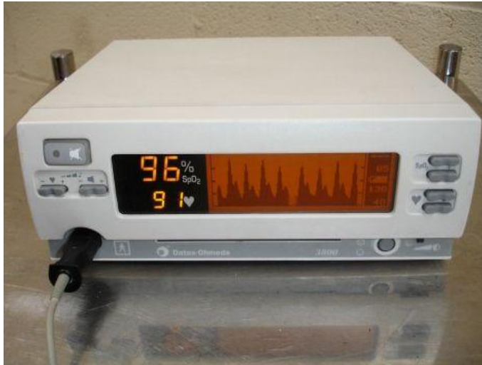
Figure 12: Pulse oximeter displaying oxygen saturation (SpO 2 ) in the blood and the pulse rate

decreased pulse pressure, and vasoconstriction. The presence or absence of a pulse is quickly detected, but the presence of a pulse does not ensure adequate blood flow.