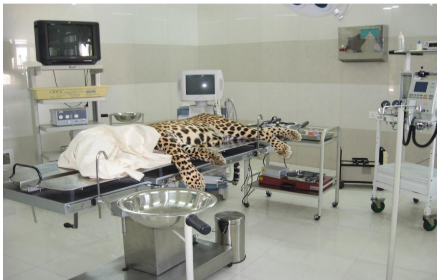
Figure 11: A State-of-art Operation Theatre at LaCONES equipped with modern instruments required for anaesthesia monitoring in wild animals. An anaesthetized Leopard is seen on the operation table before performing electroejaculation procedure