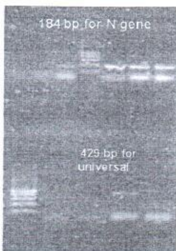
PCR based diagnosis of CDV