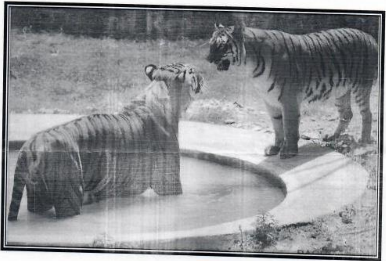
Kota Zoo, Kota Rajasthan