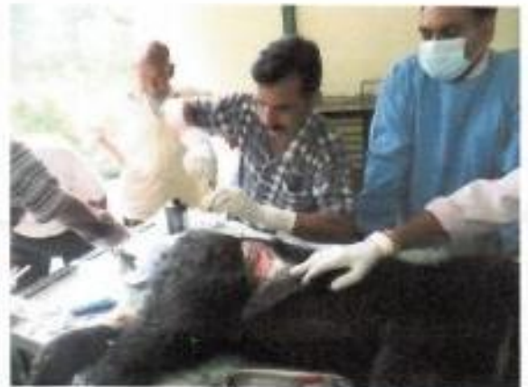
Treatment of Himalayan Black Bear