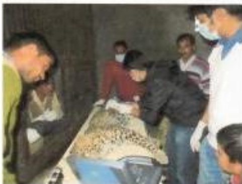
Treatment of Leopard