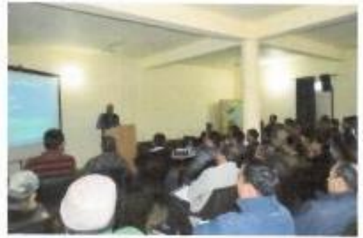
Workshop at DNP Gopalpur