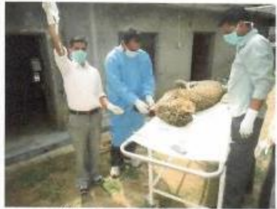
Treatment of Leopard