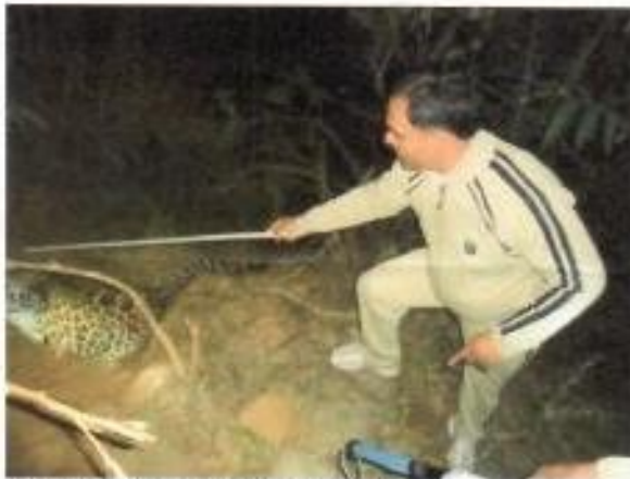
Rescue of Leopard in Wild