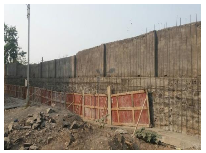
Figure: 2 -construction of RCC wall compound is under process

• In front of Mahatma Gandhi Zoo gate, there is road work going on to avoid inconvenience of the public.