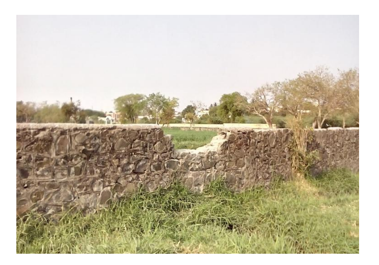
Figure: 1 - Old wall compound

• SMC has allocated Rs.1.25 Cr. Budget and work is started in January, 2018, which is expected to complete by October, 2018. New perimeter wall work is under progress around the zoo .This is 1.50 mm (6 inch) thick, 747 m length, Concrete wall height 2.40 m, chain link fencing wall 1.60 m., Total height of 14 ft. (4.5 meter.) with Bar bending (1.75m)