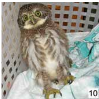
Photos 9 & 10: Boxes for transportation of small mammals and birds